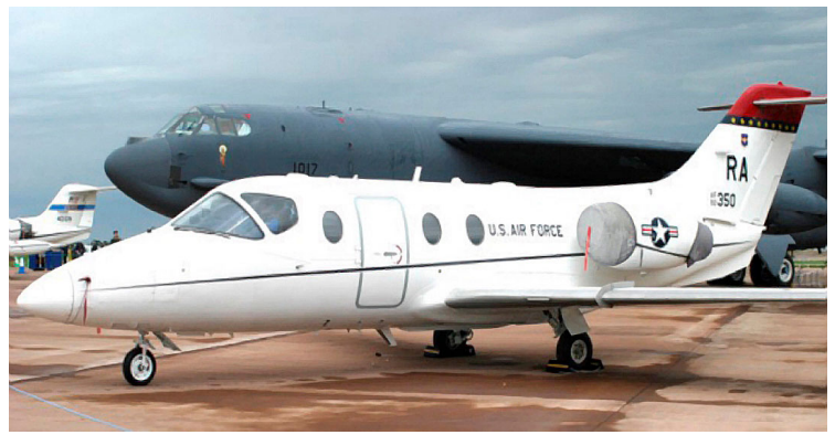
T-1A Jayhawk (Beechjet) Engine & Pitot Cover set