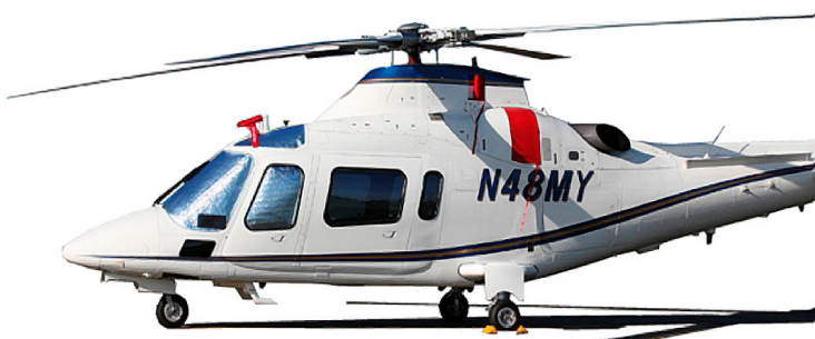
Agusta Power Pitot Covers, Intake Covers, and Cockpit Heatshield set