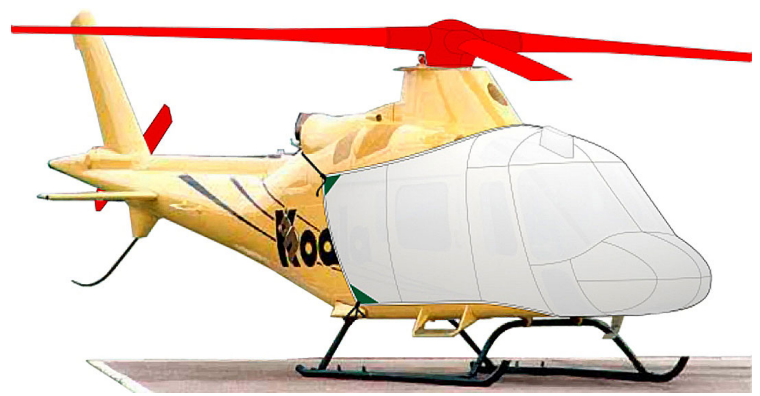
Koala Bubble, Rotor Hub, Blade & Tail Rotor Covers (illustration)