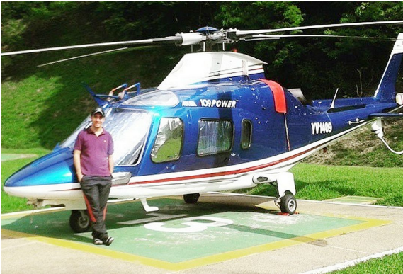
Agusta Power Cockpit & Cabin HeatShields