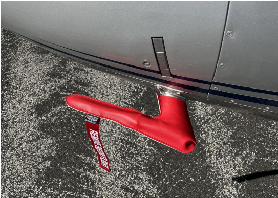
Agusta Power Pitot Covers, Intake Covers, and Cockpit Heatshield set