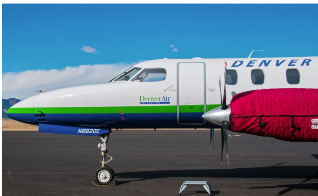
Merlin Insulated Engine Covers

This cover type is made from Silver Acrylic Sunbrella canvas and is 100% lined with a soft and smooth microfiber. Bruce's Custom Covers developed this material combination especially for aircraft protection. The outer material is medium weight and treated for water resistance, UV resistance and anti-static buildup. The inner lining is a very soft and smooth microfiber to prevent scratching. The material is very reflective, and tests show that the cabin interior temperature can be reduced to near-ambient temperature on the hottest of days. It is water, ice and snow repellent, yet breathable to allow moisture to escape from between the cover and the aircraft surface.