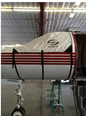
Merlin Cockpit Cover

This cover type is made from Silver Acrylic Sunbrella canvas and is 100% lined with a soft and smooth microfiber. Bruce's Custom Covers developed this material combination especially for aircraft protection. The outer material is medium weight and treated for water resistance, UV resistance and anti-static buildup. The inner lining is a very soft and smooth microfiber to prevent scratching. The material is very reflective, and tests show that the cabin interior temperature can be reduced to near-ambient temperature on the hottest of days. It is water, ice and snow repellent, yet breathable to allow moisture to escape from between the cover and the aircraft surface.