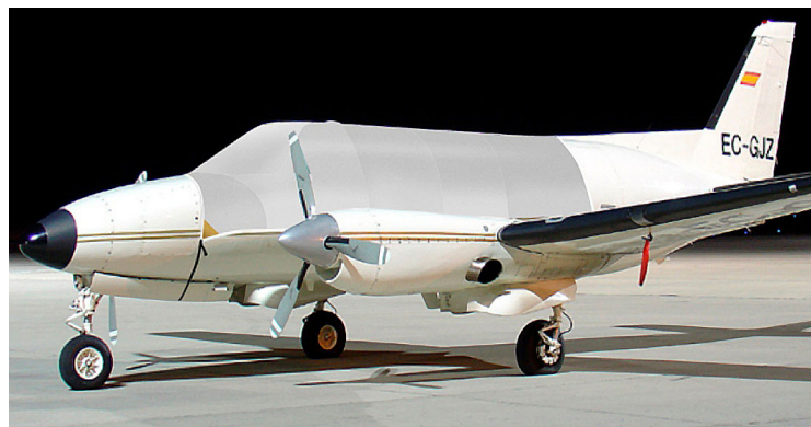
Merlin Canopy Cover (illustration)