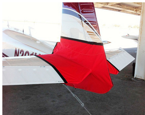
Mooney Tailcone Cover, completely enclosed