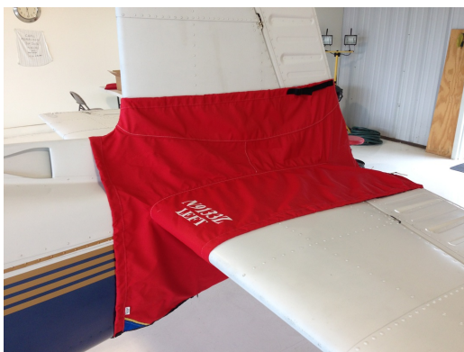
Mooney Tailcone Cover

WINTER USE MATERIAL - Made with Solution-Dyed Polyester fabric, this option is intended for seasonal use to aid in deicing, rain mitigation, or for occasional travel. The material is lighter and more compact, but more susceptible to UV damage and may have a shorter useful life if used continuously outside than the all-year use material.