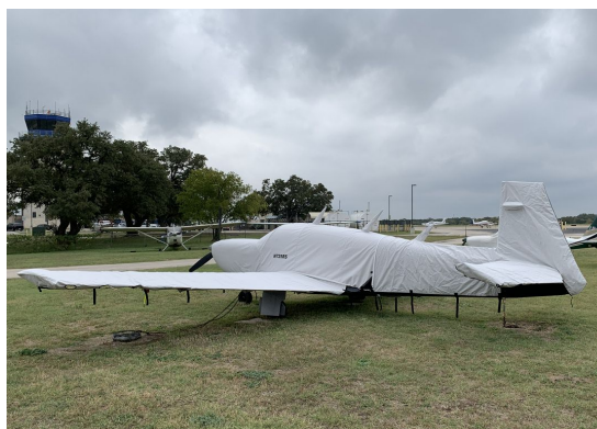
Mooney M20M Bravo Cover Set