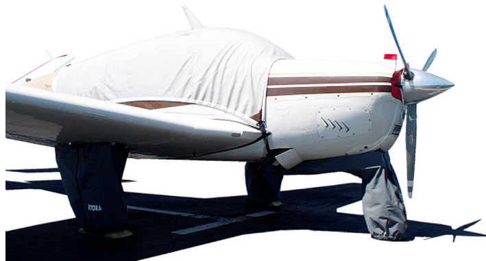
Beech Bonanza/Debonair/Baron Landing Gear Covers