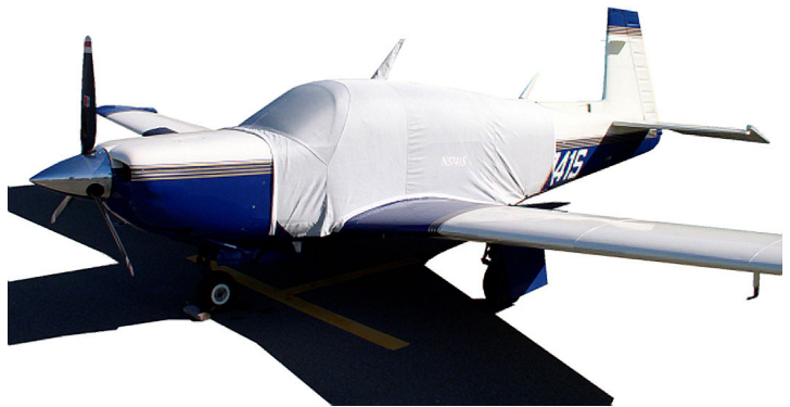
Mooney Extended Canopy Cover