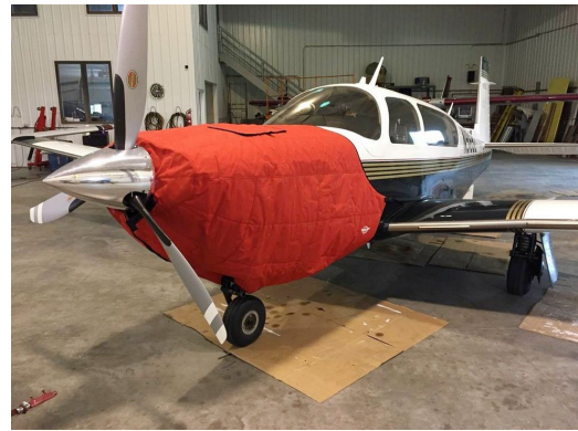
Mooney Ovation Insulated Engine Cover