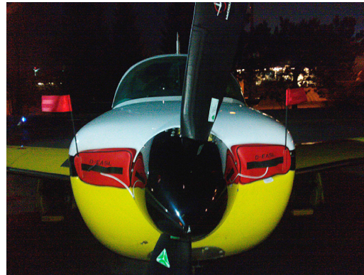
Mooney 231 Engine Inlet Plugs