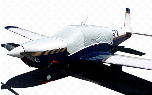
Porsche Mooney Canopy Cover & Plugs

Travel Covers are made with Silver Solution-Dyed Polyester fabric and only lined over the windshield to save weight. The material is lightweight and more compact for easy stowage in the aircraft. The polyester material is water resistant, but only intended for occasional use outside. We also have an ultra lightweight material available for fitted hangar dust covers. For daily outdoor use, the non-travel Sunbrella Cover is the best choice.