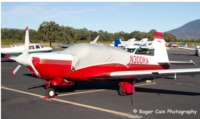
Mooney M20M Bravo Canopy Cover, 3-Blade Prop Cover

This cover type is made from Silver Acrylic Sunbrella canvas and is 100% lined with a soft and smooth microfiber. Bruce's Custom Covers developed this material combination especially for aircraft protection. The outer material is medium weight and treated for water resistance, UV resistance and anti-static buildup. The inner lining is a very soft and smooth microfiber to prevent scratching. The material is very reflective, and tests show that the cabin interior temperature can be reduced to near-ambient temperature on the hottest of days. It is water, ice and snow repellent, yet breathable to allow moisture to escape from between the cover and the aircraft surface.