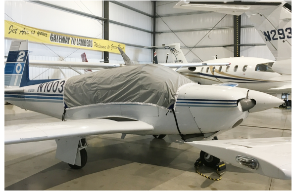
Mooney 201 Travel Cover, Light Weight Travel Canopy Cover, 5 Lbs