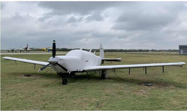
Mooney M20M Bravo Cover Set

This cover type is made from Silver Acrylic Sunbrella canvas and is 100% lined with a soft and smooth microfiber. Bruce's Custom Covers developed this material combination especially for aircraft protection. The outer material is medium weight and treated for water resistance, UV resistance and anti-static buildup. The inner lining is a very soft and smooth microfiber to prevent scratching. The material is very reflective, and tests show that the cabin interior temperature can be reduced to near-ambient temperature on the hottest of days. It is water, ice and snow repellent, yet breathable to allow moisture to escape from between the cover and the aircraft surface.