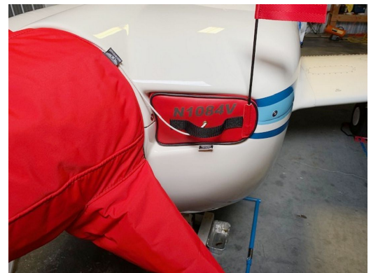
Mooney Engine Inlet Plug & Prop Cover