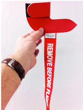
Standard Pitot Cover

Engine Inlet Plugs are custom fit for your Mooney Eagle intakes, made with heavy-duty vinyl material, and stuffed with a single block of sculpted urethane foam. Each plug has a zipper that allows the foam to be removed and dried if necessary. Engine plugs have warning flags that are visible from the cockpit or 'remove before flight' streamers sewn onto the face of the plugs. Most plugs are imprinted with the aircraft registration number in black for an extra charge. Storage bag NOT included. Engine plugs may be inserted after flight when the engine is still warm. Engine Inlet Plugs are commonly referred to as Cowl Plugs, Intake Plugs, Cowl Blocks, Engine Blocks, and Engine Bungs.