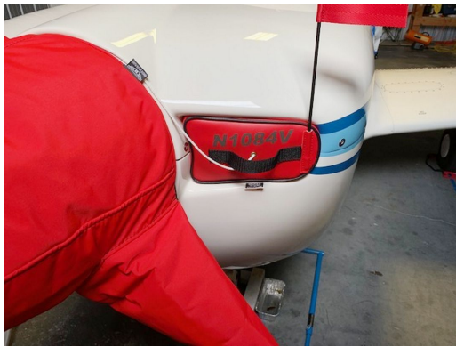
Mooney Engine Inlet Plug & Prop Cover

This cover type is made from Silver Acrylic Sunbrella canvas and is 100% lined with a soft and smooth microfiber. Bruce's Custom Covers developed this material combination especially for aircraft protection. The outer material is medium weight and treated for water resistance, UV resistance and anti-static buildup. The inner lining is a very soft and smooth microfiber to prevent scratching. The material is very reflective, and tests show that the cabin interior temperature can be reduced to near-ambient temperature on the hottest of days. It is water, ice and snow repellent, yet breathable to allow moisture to escape from between the cover and the aircraft surface.