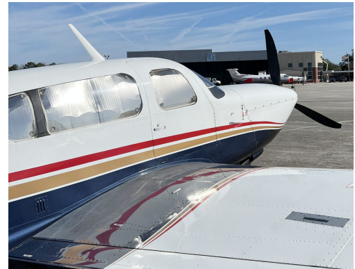
Mooney M20S Heatshield Set