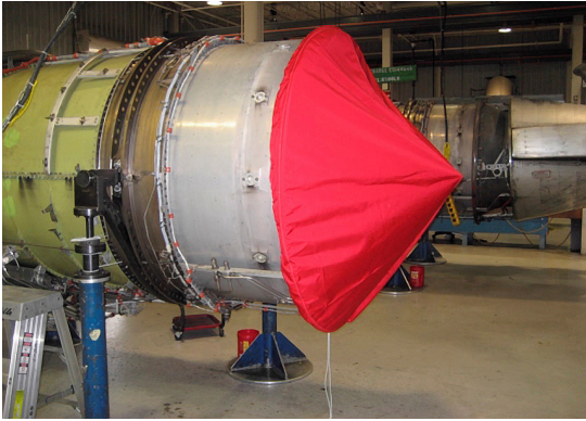
PW JT8D Off-Link Engine Shower Cap Cover Set

material, and stuffed with a single block of sculpted urethane foam. Each plug has a zipper that allows the foam to be removed and dried if necessary. Engine plugs have 'remove before flight' streamers sewn onto the face of the plugs. Most plugs are imprinted with the aircraft registration number in black for an extra charge. Storage bag NOT included. Engine plugs may be inserted after flight when the engine is still warm. Engine Inlet Plugs are commonly referred to as Cowl Plugs, Intake Plugs, Cowl Blocks, Engine Blocks, and Engine Bungs.