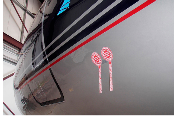
Static Port & Small Inlet/Vent Adhesive Covers: Ideal for Wash Prep and Maintenance