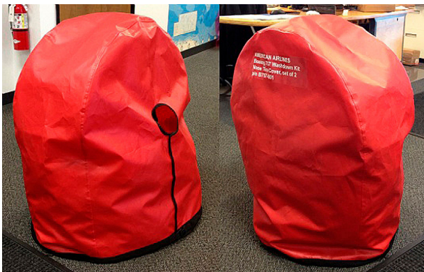
Boeing 757 Tire Covers, great for Wash Prep or Storage

ALL-YEAR USE MATERIAL - Made with Silver Acrylic Sunbrella canvas, the all-year use material is the best option for sun protection and cover longevity. This heavier more durable material is intended for all weather conditions, such as rain and snow or lots of sun.