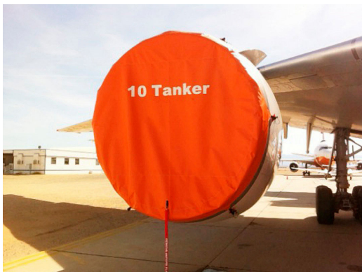
DC-10 Intake Cover