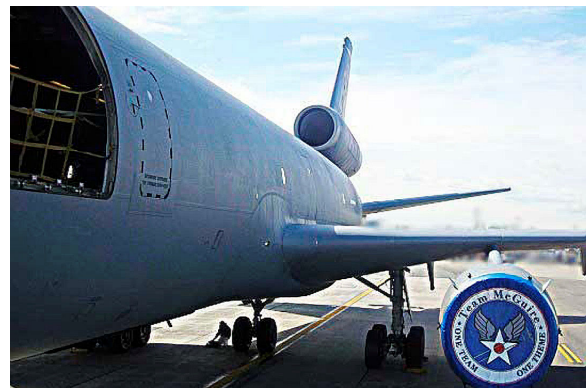
KC-10 Intake Cover at McGuire AFB, NJ