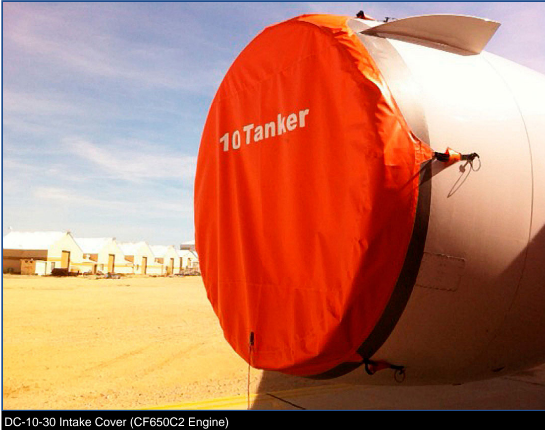
DC-10-30 Intake Cover (CF650C2 Engine)