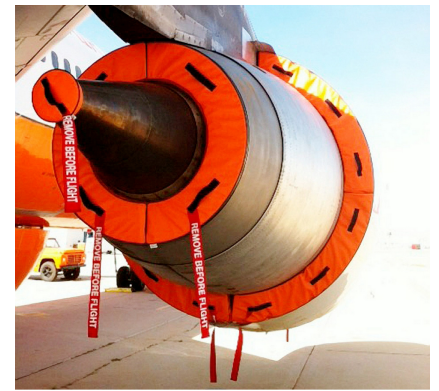
Exhaust Plugs Ship Set, incl. Fan Thrust Reverser and Exhaust Plugs P/N: B767-200