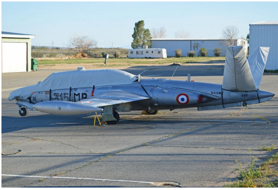
Fougas Magister Canopy/Nose Cover, Tail Stabilizer Covers