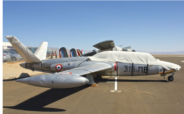
Fougua Magister Canopy/Nose Cover, Tail Stabilizer Covers