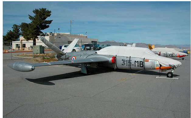
Fouga Magister Canopy/Nose Cover & Tail Stabilizer Covers