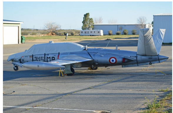
Fouga Magister Canopy/Nose Cover, Tail Stabilizer Covers