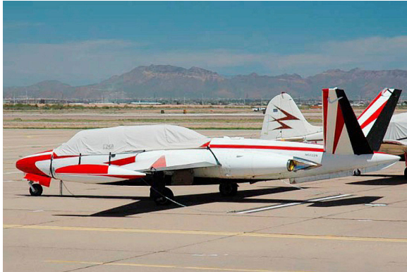
Fougua Magister Canopy Cover

This cover type is made from Silver Acrylic Sunbrella canvas and is 100% lined with a soft and smooth microfiber. Bruce's Custom Covers developed this material combination especially for aircraft protection. The outer material is medium weight and treated for water resistance, UV resistance and anti-static buildup. The inner lining is a very soft and smooth microfiber to prevent scratching. The material is very reflective, and tests show that the cabin interior temperature can be reduced to near-ambient temperature on the hottest of days. It is water, ice and snow repellent, yet breathable to allow moisture to escape from between the cover and the aircraft surface.