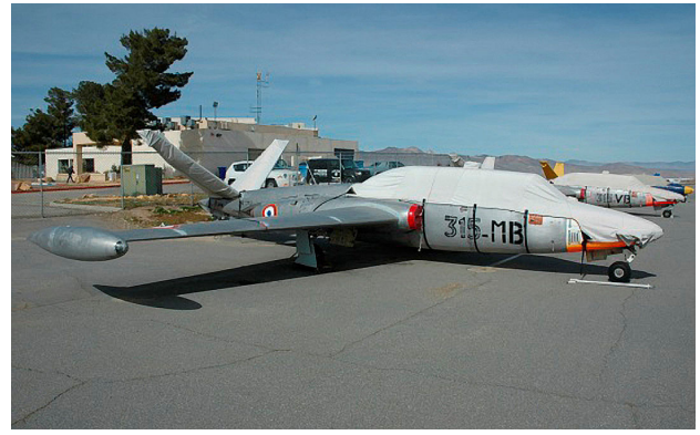
Fougas Magister Canopy/Nose Cover & Tail Stabilizer Covers