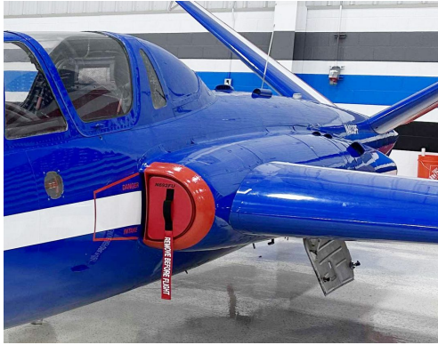
Fougas Magister CM170 Intake Plugs