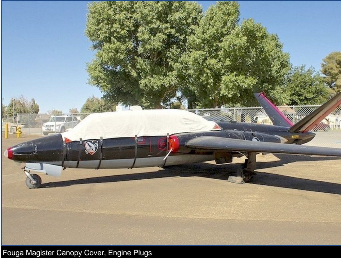
Fouga Magister Canopy Cover, Engine Plugs