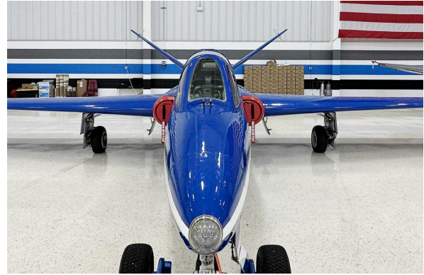
Fougas Magister CM170 Intake Plugs