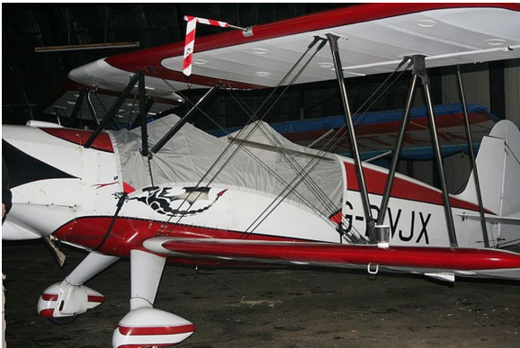
Marquardt Charger MA-5 Light Weight Travel Cockpit Cover

This cover type is made from Silver Acrylic Sunbrella canvas and is 100% lined with a soft and smooth microfiber. Bruce's Custom Covers developed this material combination especially for aircraft protection. The outer material is medium weight and treated for water resistance, UV resistance and anti-static buildup. The inner lining is a very soft and smooth microfiber to prevent scratching. The material is very reflective, and tests show that the cabin interior temperature can be reduced to near-ambient temperature on the hottest of days. It is water, ice and snow repellent, yet breathable to allow moisture to escape from between the cover and the aircraft surface.