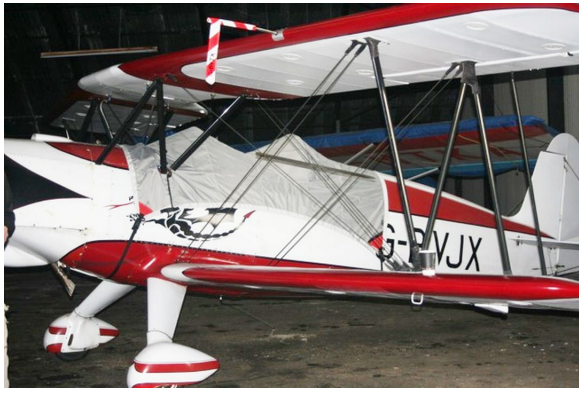
Marquardt Charger MA-5 Canopy Cover