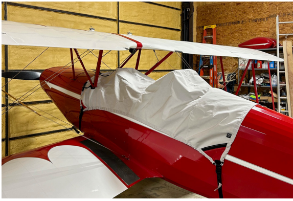
Marquardt Charger MA-5 Cockpit Cover