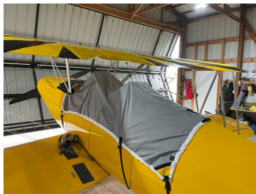
Marquardt Charger Travel Weight Canopy Cover