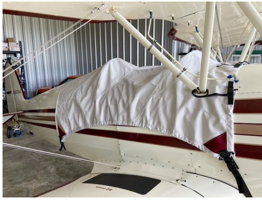
Marquardt Charger Cockpit Cover