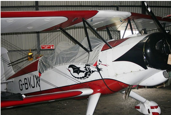
Marquardt Charger MA-5 Light Weight Travel Cockpit Cover