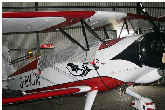
Marquardt Charger MA-5 Light Weight Travel Cockpit Cover

This cover type is made from Silver Acrylic Sunbrella canvas and is 100% lined with a soft and smooth microfiber. Bruce's Custom Covers developed this material combination especially for aircraft protection. The outer material is medium weight and treated for water resistance, UV resistance and anti-static buildup. The inner lining is a very soft and smooth microfiber to prevent scratching. The material is very reflective, and tests show that the cabin interior temperature can be reduced to near-ambient temperature on the hottest of days. It is water, ice and snow repellent, yet breathable to allow moisture to escape from between the cover and the aircraft surface.