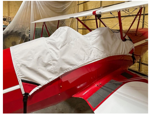
Marquardt Charger MA-5 Cockpit Cover