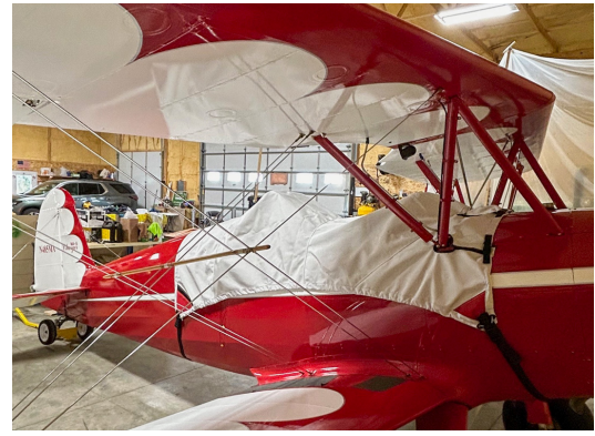
Marquardt Charger MA-5 Cockpit Cover