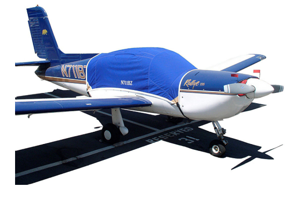
Rallye 150 Canopy Cover