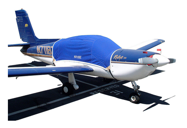
Rallye Canopy Cover