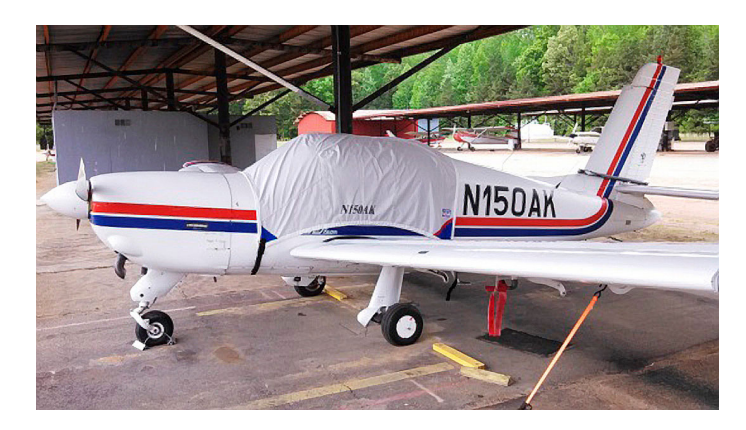
Rallye Canopy Cover

Travel Covers are made with Silver Solution-Dyed Polyester fabric and only lined over the windshield to save weight. The material is lightweight and more compact for easy stowage in the aircraft. The polyester material is water resistant, but only intended for occasional use outside. We also have an ultra lightweight material available for fitted hangar dust covers. For daily outdoor use, the non-travel Sunbrella Cover is the best choice.