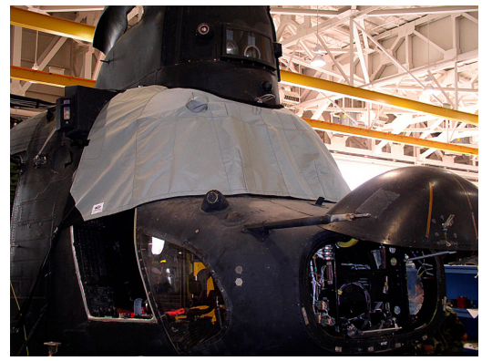
Boeing Vertol CH-47 Windshield/Cockpit Cover