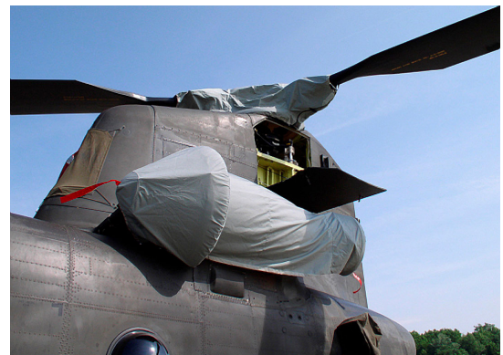
Boeing Vertol CH-47 Engine and Rotor Hub Covers