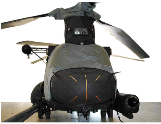
Boeing Vertol CH-47 Forward Cabin & Rotor Hub Cover