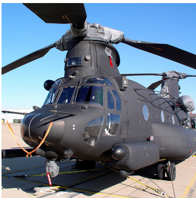
Boeing Vertol MH-47 Rotor Hubs, Engine & Other Covers

Insulated Covers Material - A special composite material of solution-dyed polyester, 3M Thinsulate insulation, and soft nylon interior fabric. Our insulated covers are designed to complement an engine preheater and help retain heat in the engine compartment after shutdown. If you operate your aircraft in cold-weather, these covers will help prevent engine wear and tear.