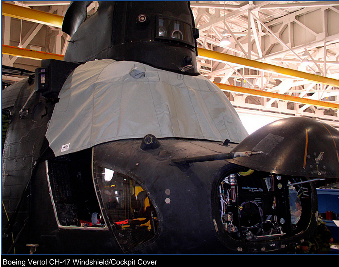
Boeing Vertol CH-47 Windshield/Cockpit Cover