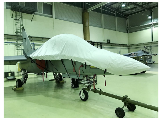
Alenia Aermacchi M-346 Canopy/Nose Cover