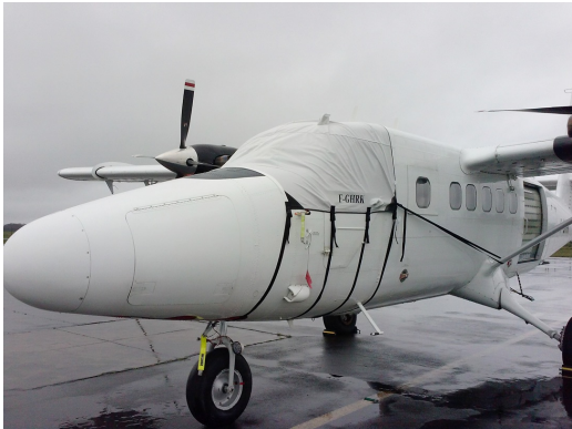
Twin Otter Cockpit Cover