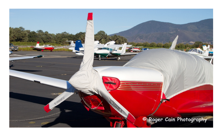
Mooney M20M Bravo 3-Blade Prop Cover, Engine Plugs