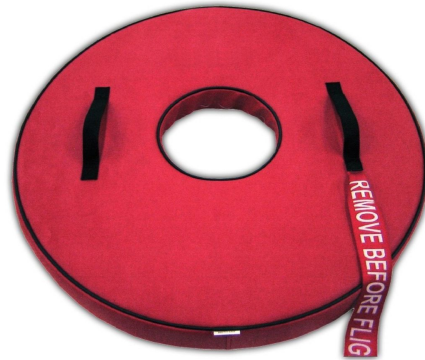
Mig 21 Intake Plug

The Engine Inlet Plugs are custom fit for your Mikoyan Mig 21 intakes, made with heavy-duty vinyl material, and stuffed with a single block of sculpted urethane foam. Each plug has a zipper that allows the foam to be removed and dried if necessary. Engine plugs have 'remove before flight' streamers sewn onto the face of the plugs. Most plugs are imprinted with the aircraft registration number in black for an extra charge. Storage bag NOT included. Engine plugs may be inserted after flight when the engine is still warm. Engine Inlet Plugs are commonly referred to as Cowl Plugs, Intake Plugs, Cowl Blocks, Engine Blocks, and Engine Bungs.