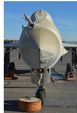
Mig 21 Canopy/Nose Cover