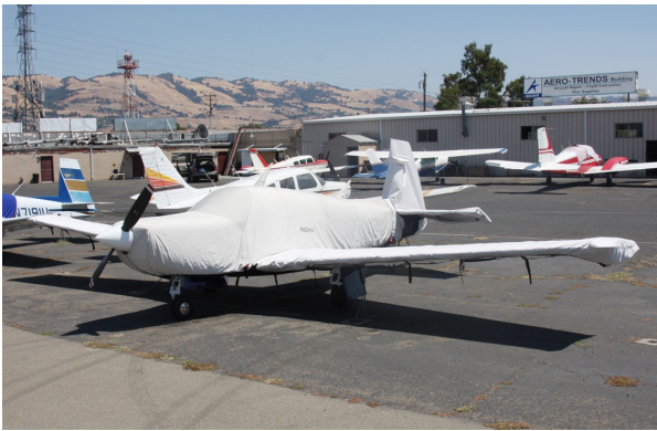
Mooney 231 Full Cover Set

This cover type is made from Silver Acrylic Sunbrella canvas and is 100% lined with a soft and smooth microfiber. Bruce's Custom Covers developed this material combination especially for aircraft protection. The outer material is medium weight and treated for water resistance, UV resistance and anti-static buildup. The inner lining is a very soft and smooth microfiber to prevent scratching. The material is very reflective, and tests show that the cabin interior temperature can be reduced to near-ambient temperature on the hottest of days. It is water, ice and snow repellent, yet breathable to allow moisture to escape from between the cover and the aircraft surface.