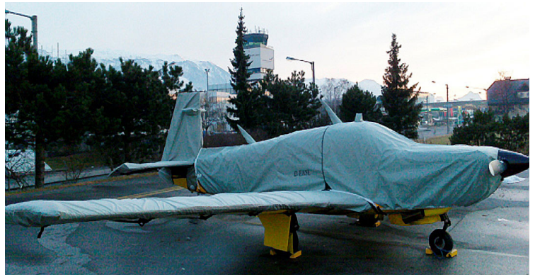
Mooney 231 Extra Extended Canopy/Engine Cover, Wing covers & Empennage Cover