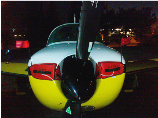
Mooney 231 Engine Inlet Plugs

Engine Inlet Plugs are custom fit for your Mooney M20V Acclaim Ultra intakes, made with heavy-duty vinyl material, and stuffed with a single block of sculpted urethane foam. Each plug has a zipper that allows the foam to be removed and dried if necessary. Engine plugs have warning flags that are visible from the cockpit or 'remove before flight' streamers sewn onto the face of the plugs. Most plugs are imprinted with the aircraft registration number in black for an extra charge. Storage bag NOT included. Engine plugs may be inserted after flight when the engine is still warm. Engine Inlet Plugs are commonly referred to as Cowl Plugs, Intake Plugs, Cowl Blocks, Engine Blocks, and Engine Bunges.