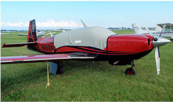
Mooney Acclaim Canopy Cover