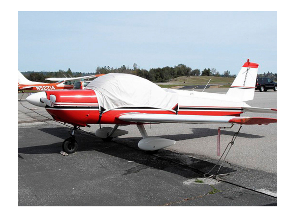
Messerschmitt BO-209 Monsun Canopy Cover