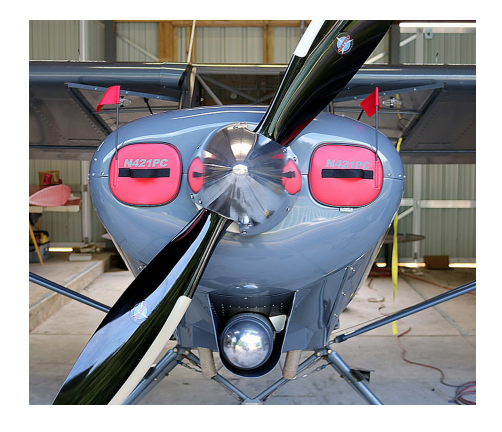
Piper PA-18 Super Cub Engine Inlet Plugs