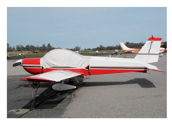
Messerschmitt BO-209 Monsun Canopy Cover