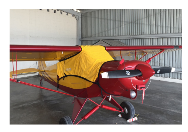
Piper Super Cub Canopy Cover, Engine Plugs