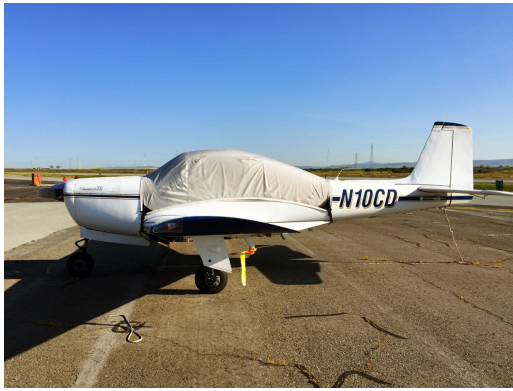
Meyer (Aero Commander) 200 Canopy Cover