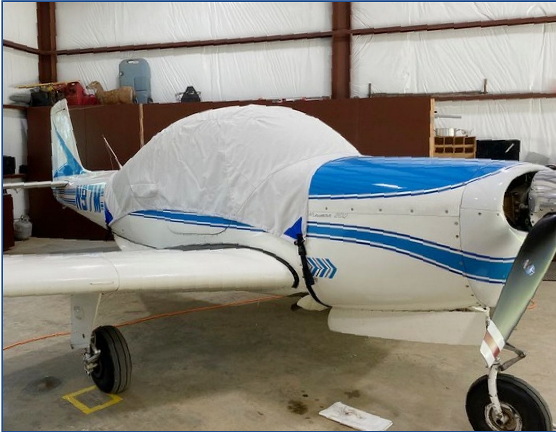
Meyers (Rockwell) 200 Canopy Cover