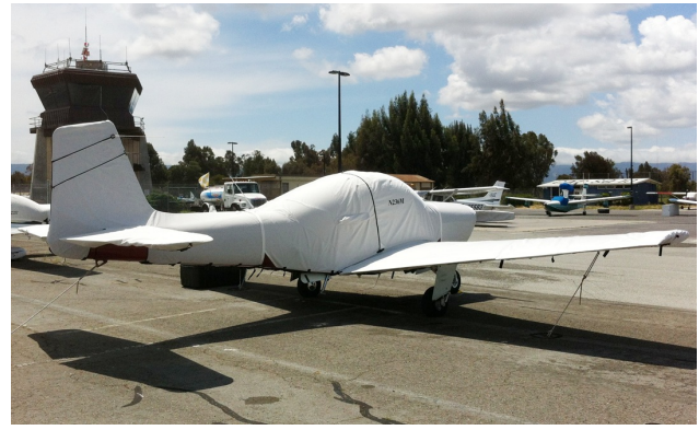
Meyers 200 Complete Cover Set