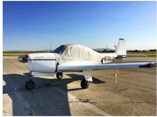
Meyer (Aero Commander) 200 Canopy Cover