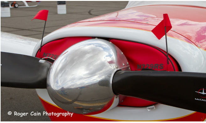
Meyer (Aero Commander) 200 Engine Plugs