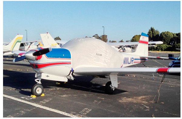
Meyers 200 Extended Canopy Cover & Engine Plugs