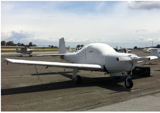
Meyers 200 Complete Cover Set