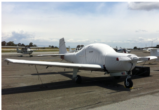
Meyers 200 Complete Cover Set

This cover type is made from Silver Acrylic Sunbrella canvas and is 100% lined with a soft and smooth microfiber. Bruce's Custom Covers developed this material combination especially for aircraft protection. The outer material is medium weight and treated for water resistance, UV resistance and anti-static buildup. The inner lining is a very soft and smooth microfiber to prevent scratching. The material is very reflective, and tests show that the cabin interior temperature can be reduced to near-ambient temperature on the hottest of days. It is water, ice and snow repellent, yet breathable to allow moisture to escape from between the cover and the aircraft surface.