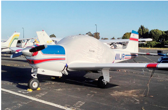
Meyers 200 Extended Canopy Cover & Engine Plugs

This cover type is made from Silver Acrylic Sunbrella canvas and is 100% lined with a soft and smooth microfiber. Bruce's Custom Covers developed this material combination especially for aircraft protection. The outer material is medium weight and treated for water resistance, UV resistance and anti-static buildup. The inner lining is a very soft and smooth microfiber to prevent scratching. The material is very reflective, and tests show that the cabin interior temperature can be reduced to near-ambient temperature on the hottest of days. It is water, ice and snow repellent, yet breathable to allow moisture to escape from between the cover and the aircraft surface.