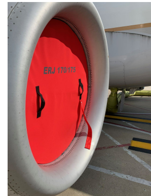
Embraer EMB-170/175 Engine Inlet Plugs