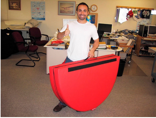
Boeing 737 FOD protection Intake Plug, folding type

ALL-YEAR USE MATERIAL - Made with Silver Acrylic Sunbrella canvas, the all-year use material is the best option for sun protection and cover longevity. This heavier more durable material is intended for all weather conditions, such as rain and snow or lots of sun.