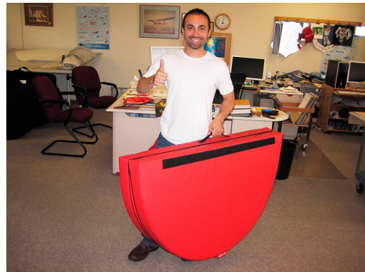
Boeing 737 FOD protection Intake Plug, folding type