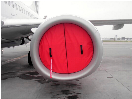
Boeing 737 Engine Intake Plug, Folding Type

The Engine Inlet Plugs are custom fit for your Embraer EMB-170/175 intakes, made with heavy-duty vinyl material, and stuffed with a single block of sculpted urethane foam. Each plug has a zipper that allows the foam to be removed and dried if necessary. Engine plugs have 'remove before flight' streamers sewn onto the face of the plugs. Most plugs are imprinted with the aircraft registration number in black for an extra charge. Storage bag NOT included. Engine plugs may be inserted after flight when the engine is still warm. Engine Inlet Plugs are commonly referred to as Cowl Plugs, Intake Plugs, Cowl Blocks, Engine Blocks, and Engine Bungs.