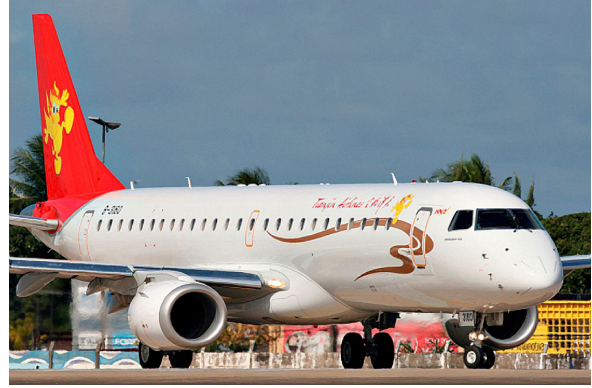
Covers, Plugs & HeatShields for Embraer 170/175/190/195