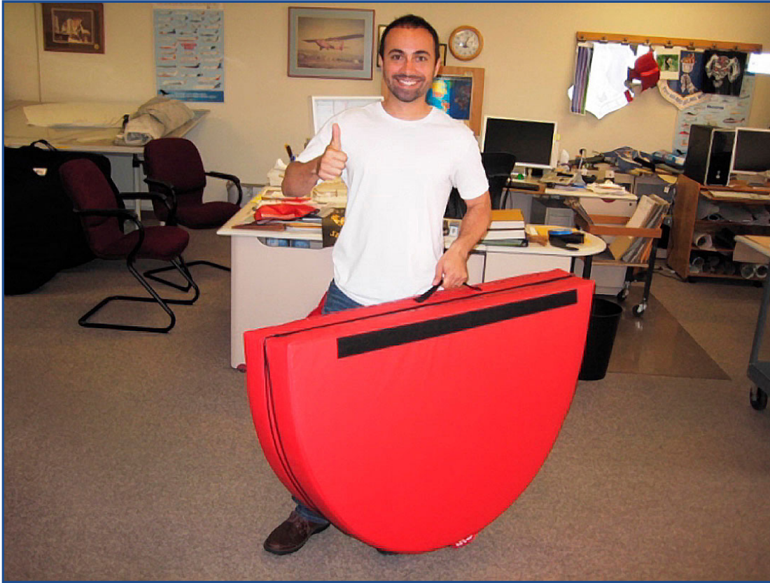
Boeing 737 FOD protection Intake Plug, folding type