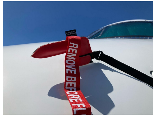
Embraer ERJ-135 Pitot/TAT/Ice Detector Covers