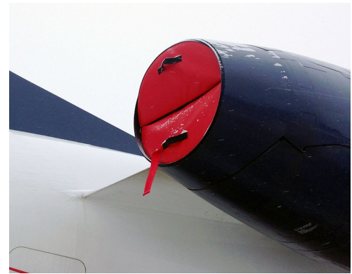
Embraer Legacy 650 Exhaust Plug