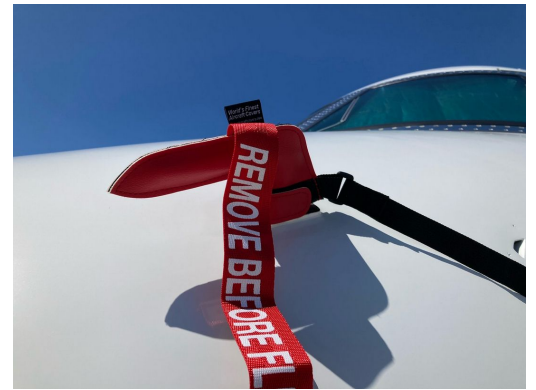
Embraer ERJ-135 Pitot/TAT/Ice Detector Covers