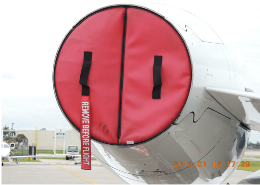
Embraer Legacy 500 Engine Exhaust Plug, folding type

The Engine Inlet Plugs are custom fit for your Embraer ERJ-135/140/145 Legacy 600, 650 intakes, made with heavy-duty vinyl material, and stuffed with a single block of sculpted urethane foam. Each plug has a zipper that allows the foam to be removed and dried if necessary. Engine plugs have 'remove before flight' streamers sewn onto the face of the plugs. Most plugs are imprinted with the aircraft registration number in black for an extra charge. Storage bag NOT included. Engine plugs may be inserted after flight when the engine is still warm. Engine Inlet Plugs are commonly referred to as Cowl Plugs, Intake Plugs, Cowl Blocks, Engine Blocks, and Engine Bungs.