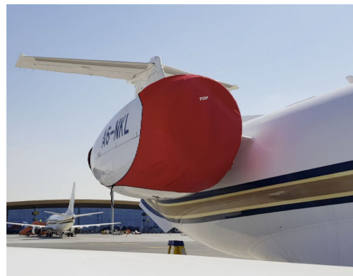
Embraer ERJ-135/140/145 Legacy 650 3-Strap Intake/Exhaust Cover