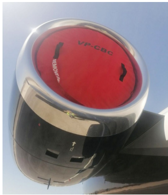
Embraer ERJ-135/140/145 Legacy 600, 650, Praetor Intake/Exhaust Plugs, Non-Folding Type

The Engine Inlet Plugs are custom fit for your Embraer ERJ-135/140/145 Legacy 600, 650 intakes, made with heavy-duty vinyl material, and stuffed with a single block of sculpted urethane foam. Each plug has a zipper that allows the foam to be removed and dried if necessary. Engine plugs have 'remove before flight' streamers sewn onto the face of the plugs. Most plugs are imprinted with the aircraft registration number in black for an extra charge. Storage bag NOT included. Engine plugs may be inserted after flight when the engine is still warm. Engine Inlet Plugs are commonly referred to as Cowl Plugs, Intake Plugs, Cowl Blocks, Engine Blocks, and Engine Bungs.