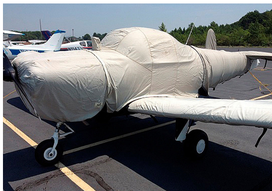
Ercoupe full cover set: Extended Canopy, Engine, Wing & Empennage covers

WINTER USE MATERIAL - Made with Solution-Dyed Polyester fabric, this option is intended for seasonal use to aid in deicing, rain mitigation, or for occasional travel. The material is lighter and more compact, but more susceptible to UV damage and may have a shorter useful life if used continuously outside than the all-year use material.