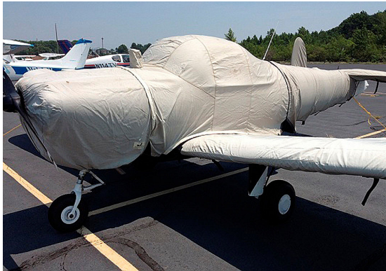
Ercoupe full cover set: Extended Canopy, Engine, Wing & Empennage covers

This cover type is made from Silver Acrylic Sunbrella canvas and is 100% lined with a soft and smooth microfiber. Bruce's Custom Covers developed this material combination especially for aircraft protection. The outer material is medium weight and treated for water resistance, UV resistance and anti-static buildup. The inner lining is a very soft and smooth microfiber to prevent scratching. The material is very reflective, and tests show that the cabin interior temperature can be reduced to near-ambient temperature on the hottest of days. It is water, ice and snow repellent, yet breathable to allow moisture to escape from between the cover and the aircraft surface.