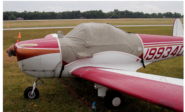
Ercoupe full cover set: Extended Canopy, Engine, Wing & Empennage covers