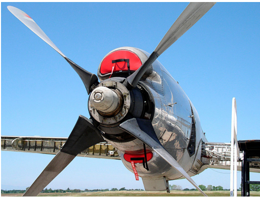
Lockheed P-3 Main Engine Inlet Plugs

Engine Inlet Plugs are custom fit for your Lockheed P-3 Orion intakes, made with heavy-duty vinyl material, and stuffed with a single block of sculpted urethane foam. Each plug has a zipper that allows the foam to be removed and dried if necessary. Engine plugs have warning flags that are visible from the cockpit or 'remove before flight' streamers sewn onto the face of the plugs. Most plugs are imprinted with the aircraft registration number in black for an extra charge. Storage bag NOT included. Engine plugs may be inserted after flight when the engine is still warm. Engine Inlet Plugs are commonly referred to as Cowl Plugs, Intake Plugs, Cowl Blocks, Engine Blocks, and Engine Bungs.