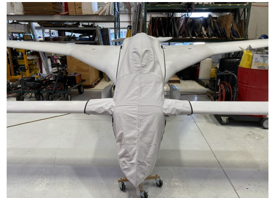
Rutan Long-EZ Canopy/Nose/Engine Cover