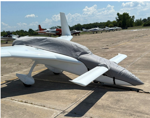
Rutan Long-EZ Canopy/Nose/Engine Cover, Travel Weight

This cover type is made from Silver Acrylic Sunbrella canvas and is 100% lined with a soft and smooth microfiber. Bruce's Custom Covers developed this material combination especially for aircraft protection. The outer material is medium weight and treated for water resistance, UV resistance and anti-static buildup. The inner lining is a very soft and smooth microfiber to prevent scratching. The material is very reflective, and tests show that the cabin interior temperature can be reduced to near-ambient temperature on the hottest of days. It is water, ice and snow repellent, yet breathable to allow moisture to escape from between the cover and the aircraft surface.