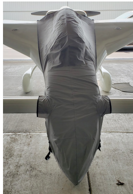
Rutan Long-EZ & Berkut Travel Cover, Light Weight Canopy/Nose Cover

Travel Covers are made with Silver Solution-Dyed Polyester fabric and only lined over the windshield to save weight. The material is lightweight and more compact for easy stowage in the aircraft. The polyester material is water resistant, but only intended for occasional use outside. We also have an ultra lightweight material available for fitted hangar dust covers. For daily outdoor use, the non-travel Sunbrella Cover is the best choice.