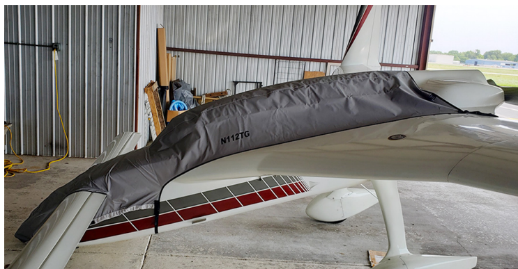
Rutan Long-EZ & Berkut Travel Cover, Light Weight Canopy/Nose Cover

Travel Covers are made with Silver Solution-Dyed Polyester fabric and only lined over the windshield to save weight. The material is lightweight and more compact for easy stowage in the aircraft. The polyester material is water resistant, but only intended for occasional use outside. We also have an ultra lightweight material available for fitted hangar dust covers. For daily outdoor use, the non-travel Sunbrella Cover is the best choice.