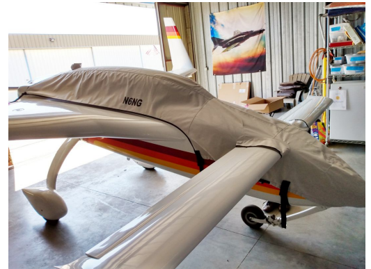
Rutan Long-EZ Canopy/Nose Cover