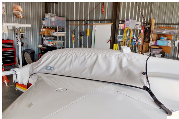
Rutan Long-EZ Canopy/Nose Cover