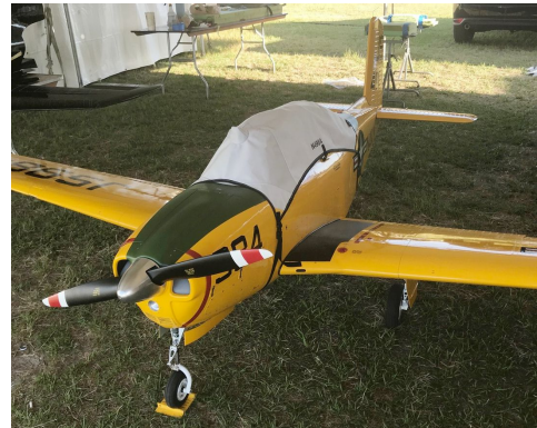
Beechcraft T-34B Mentor Canopy Cover, for 36% Scale Model