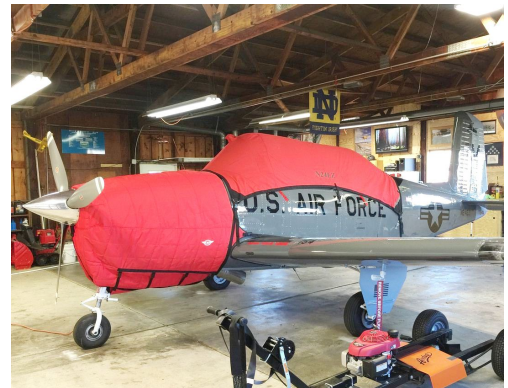
Beech T34 Mentor Canopy Cover, Insulated Engine Cover