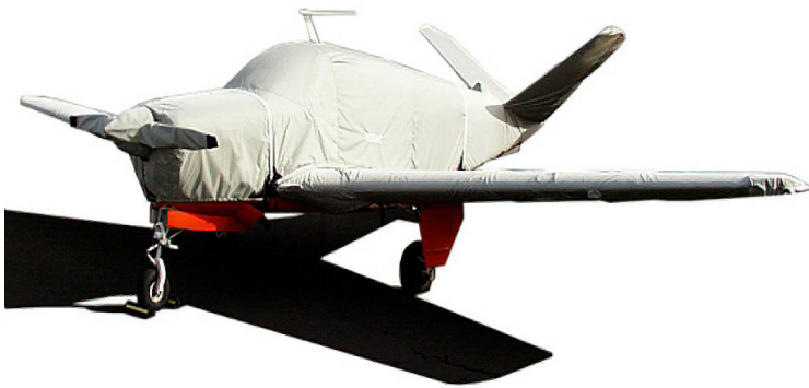
Beech Bonanza Full Cover Set

This cover type is made from Silver Acrylic Sunbrella canvas and is 100% lined with a soft and smooth microfiber. Bruce's Custom Covers developed this material combination especially for aircraft protection. The outer material is medium weight and treated for water resistance, UV resistance and anti-static buildup. The inner lining is a very soft and smooth microfiber to prevent scratching. The material is very reflective, and tests show that the cabin interior temperature can be reduced to near-ambient temperature on the hottest of days. It is water, ice and snow repellent, yet breathable to allow moisture to escape from between the cover and the aircraft surface.