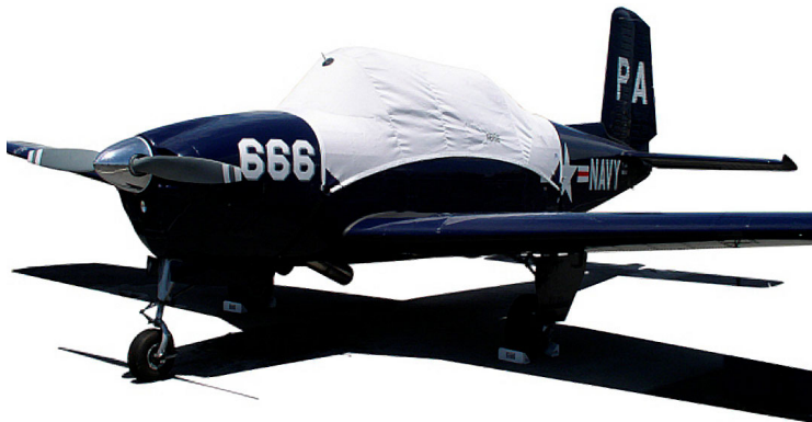
The T34 Canopy Cover

Travel Covers are made with Silver Solution-Dyed Polyester fabric and only lined over the windshield to save weight. The material is lightweight and more compact for easy stowage in the aircraft. The polyester material is water resistant, but only intended for occasional use outside. We also have an ultra lightweight material available for fitted hangar dust covers. For daily outdoor use, the non-travel Sunbrella Cover is the best choice.