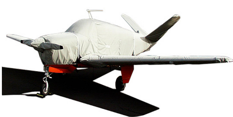
Beech Bonanza Full Cover Set

WINTER USE MATERIAL - Made with Solution-Dyed Polyester fabric, this option is intended for seasonal use to aid in deicing, rain mitigation, or for occasional travel. The material is lighter and more compact, but more susceptible to UV damage and may have a shorter useful life if used continuously outside than the all-year use material.