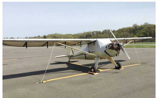
Luscombe Over-Top Canopy Cover & Wing Covers