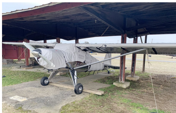
Luscombe Canopy, Wings, Engine & Empennage Covers