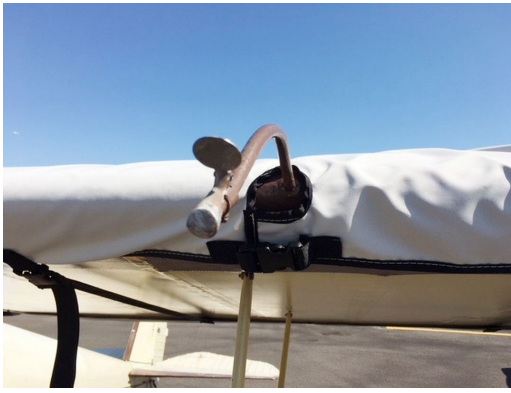
Luscombe 8A-8F Silvaire Wing Covers, Pitot Tube detail.