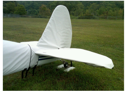
Luscombe Empennage Cover, two-piece design