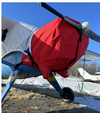
Luscombe 8E Canopy Cover w/Wing Extensions, Insulated Engine Cover