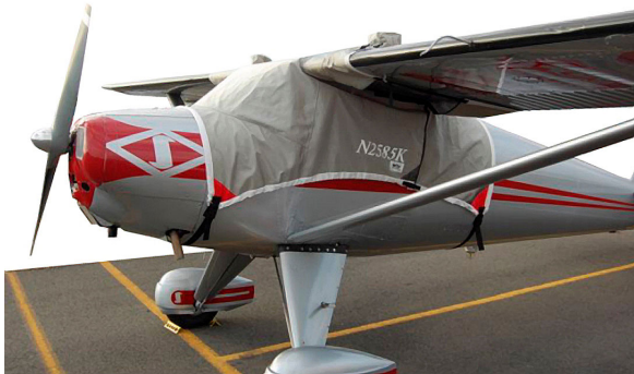
Luscomb Over-Top Canopy Cover

This cover type is made from Silver Acrylic Sunbrella canvas and is 100% lined with a soft and smooth microfiber. Bruce's Custom Covers developed this material combination especially for aircraft protection. The outer material is medium weight and treated for water resistance, UV resistance and anti-static buildup. The inner lining is a very soft and smooth microfiber to prevent scratching. The material is very reflective, and tests show that the cabin interior temperature can be reduced to near-ambient temperature on the hottest of days. It is water, ice and snow repellent, yet breathable to allow moisture to escape from between the cover and the aircraft surface.