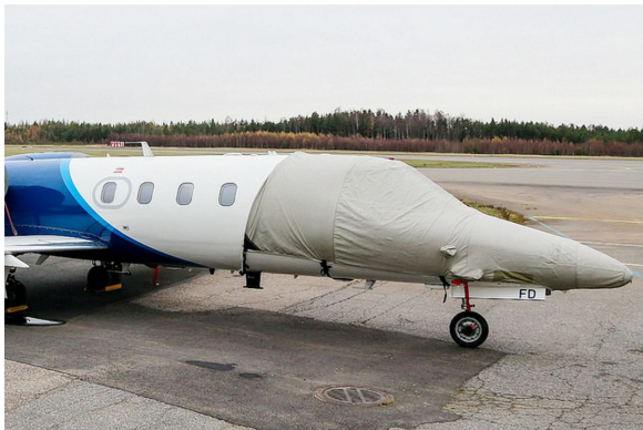
Learjet Cockpit/Nose Cover

This cover type is made from Silver Acrylic Sunbrella canvas and is 100% lined with a soft and smooth microfiber. Bruce's Custom Covers developed this material combination especially for aircraft protection. The outer material is medium weight and treated for water resistance, UV resistance and anti-static buildup. The inner lining is a very soft and smooth microfiber to prevent scratching. The material is very reflective, and tests show that the cabin interior temperature can be reduced to near-ambient temperature on the hottest of days. It is water, ice and snow repellent, yet breathable to allow moisture to escape from between the cover and the aircraft surface.