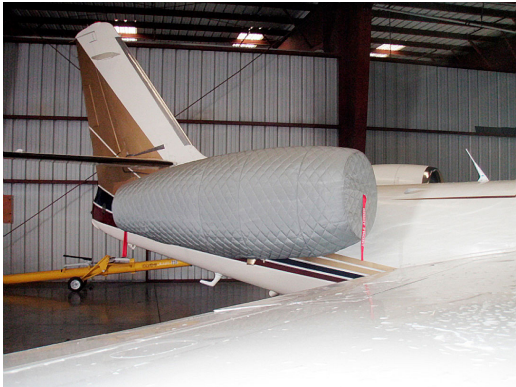
IAI Westwind Insulated Engine Nacelle Cover

The Lear Models 70 & 75 Bikini Style Engine Covers are a single-piece design using a soft and smooth stretchy and fabric. The cover stretches tightly over both the intake and exhaust, installing quickly and easily. These covers are designed to be used as hangar dust covers and have a useful life of approximately one year.