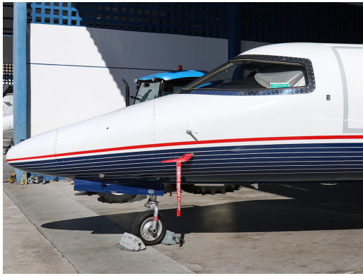
Lear Pitot Covers