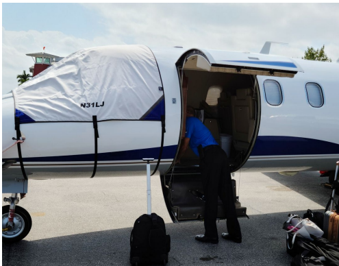
Lear 31A Cockpit Cover