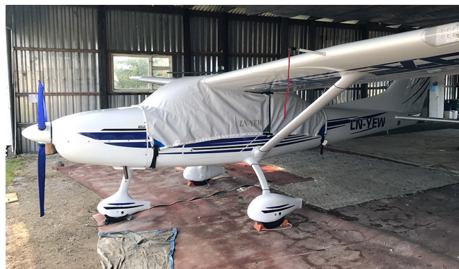
TL Ultralight Sirius TL-3000 Canopy Cover (Over-The-Top Style) TL Ultralight Sirius TL-3000 Canopy Cover (Over-The-Top Style)