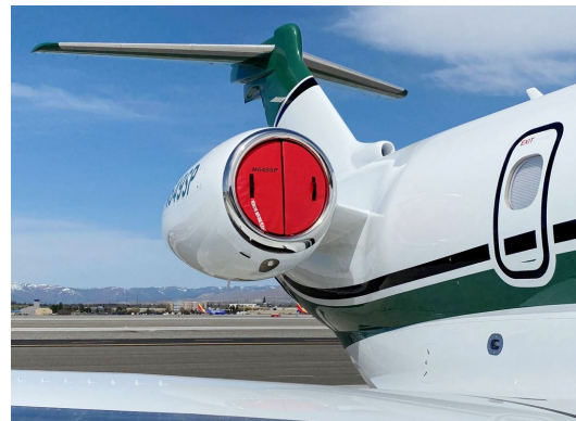
Embraer Legacy 500 Engine Inlet Plugs, folding type