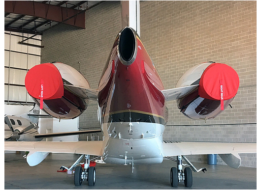
Hawker Beechcraft Premier Engine Covers, 3-Strap Style