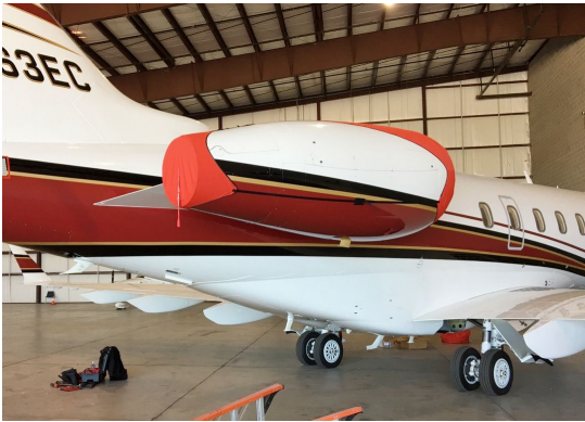
Canadair Challenger 300 Intake/Exhaust Covers, 3-Strap Type