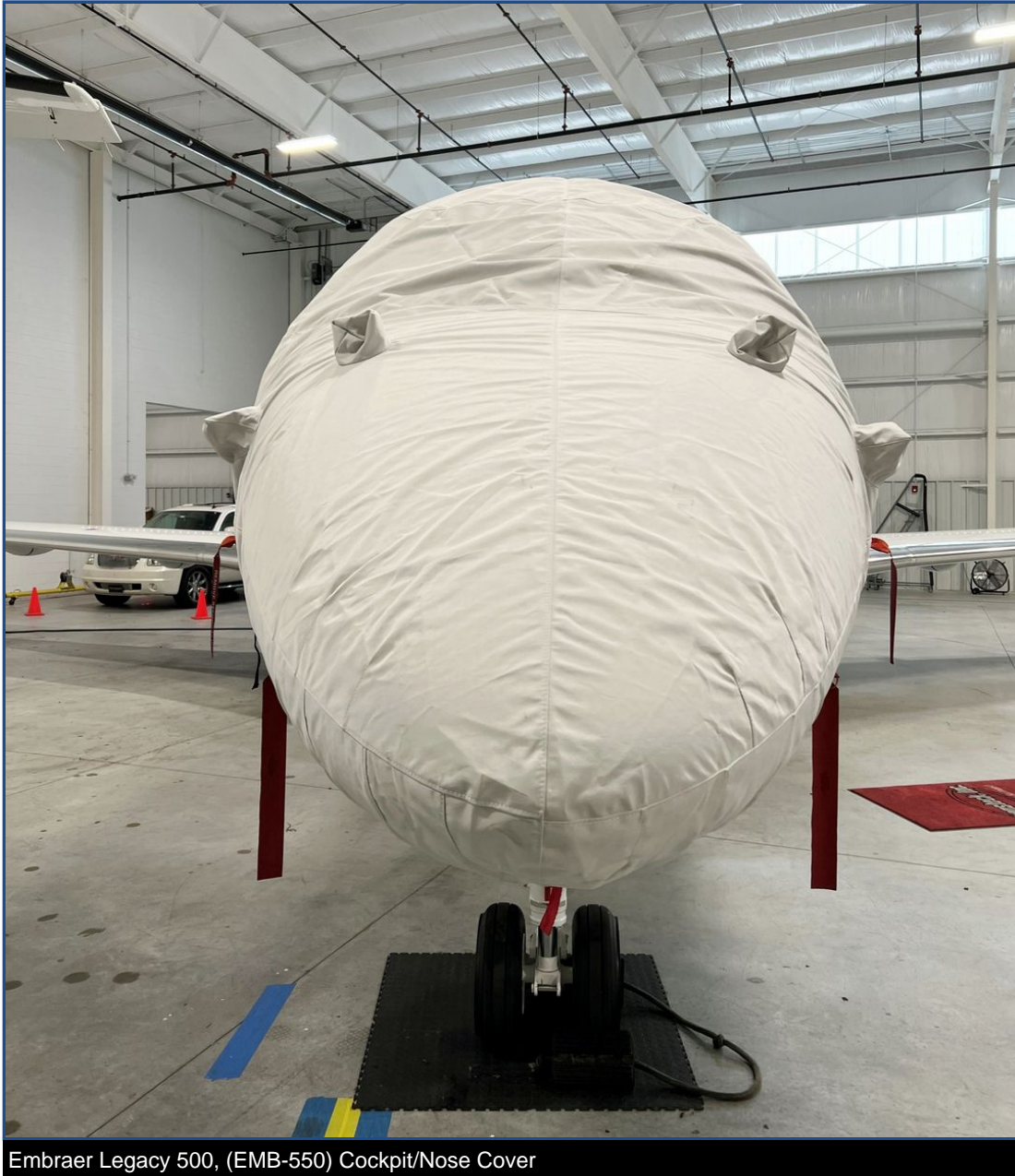
Embraer Legacy 500, (EMB-550) Cockpit/Nose Cover