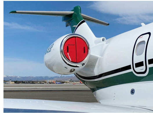
Embraer Legacy 500 Engine Exhaust Plug, folding type