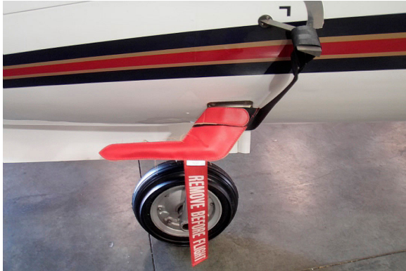
Learjet Heat Resistant Pitot Cover and AOA Strap

The Engine Inlet Plugs are custom fit for your Lear 55 intakes, made with heavy-duty vinyl material, and stuffed with a single block of sculpted urethane foam. Each plug has a zipper that allows the foam to be removed and dried if necessary. Engine plugs have 'remove before flight' streamers sewn onto the face of the plugs. Most plugs are imprinted with the aircraft registration number in black for an extra charge. Storage bag NOT included. Engine plugs may be inserted after flight when the engine is still warm. Engine Inlet Plugs are commonly referred to as Cowl Plugs, Intake Plugs, Cowl Blocks, Engine Blocks, and Engine Bungs.