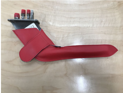
Lear 55 Pitot Cover

The Engine Inlet Plugs are custom fit for your Lear 55 intakes, made with heavy-duty vinyl material, and stuffed with a single block of sculpted urethane foam. Each plug has a zipper that allows the foam to be removed and dried if necessary. Engine plugs have 'remove before flight' streamers sewn onto the face of the plugs. Most plugs are imprinted with the aircraft registration number in black for an extra charge. Storage bag NOT included. Engine plugs may be inserted after flight when the engine is still warm. Engine Inlet Plugs are commonly referred to as Cowl Plugs, Intake Plugs, Cowl Blocks, Engine Blocks, and Engine Bungs.