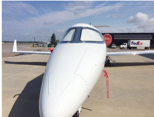
Lear Models 40 & 45 Cockpit Heatshields, Covers All Cockpit Windows

Cockpit Heatshields are interior sunshades for the aircraft's cockpit. The product is a unique composite of closed-cell foam with a silver mylar finish. The semi-rigid design is stiff enough to stand inside the window framing. The set folds up flat and is easily stored in the included storage sleeve. Some designs may require velcro and suction cups. Our Heatshields for jets are offered white side out because some aircraft manufacturers have issued advisories against reflective window inserts due to potential heat damage. A Heatshield is an excellent short-term remedy for cockpit overheating, but an external fabric cover is more effective for long-term protection.