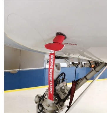
Grumman Gulfstream G-V Rosemont/TAT Cover