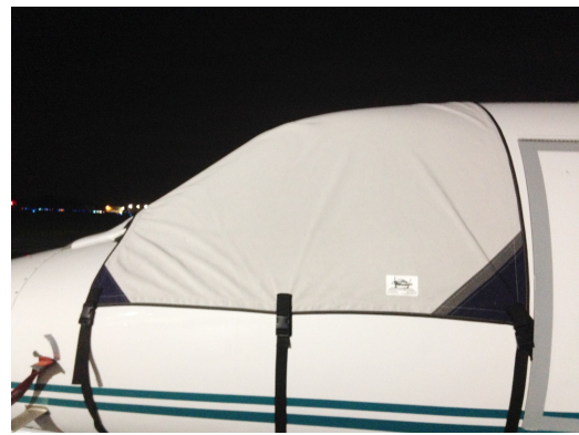
Lear 31 Cockpit Cover