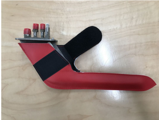
Lear 55 Pitot Cover

The Engine Inlet Plugs are custom fit for your Lear 55 intakes, made with heavy-duty vinyl material, and stuffed with a single block of sculpted urethane foam. Each plug has a zipper that allows the foam to be removed and dried if necessary. Engine plugs have 'remove before flight' streamers sewn onto the face of the plugs. Most plugs are imprinted with the aircraft registration number in black for an extra charge. Storage bag NOT included. Engine plugs may be inserted after flight when the engine is still warm. Engine Inlet Plugs are commonly referred to as Cowl Plugs, Intake Plugs, Cowl Blocks, Engine Blocks, and Engine Bungs.