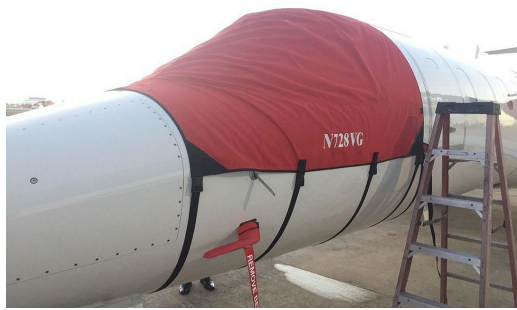
Learjet 45 Cockpit Cover

This cover type is made from Silver Acrylic Sunbrella canvas and is 100% lined with a soft and smooth microfiber. Bruce's Custom Covers developed this material combination especially for aircraft protection. The outer material is medium weight and treated for water resistance, UV resistance and anti-static buildup. The inner lining is a very soft and smooth microfiber to prevent scratching. The material is very reflective, and tests show that the cabin interior temperature can be reduced to near-ambient temperature on the hottest of days. It is water, ice and snow repellent, yet breathable to allow moisture to escape from between the cover and the aircraft surface.