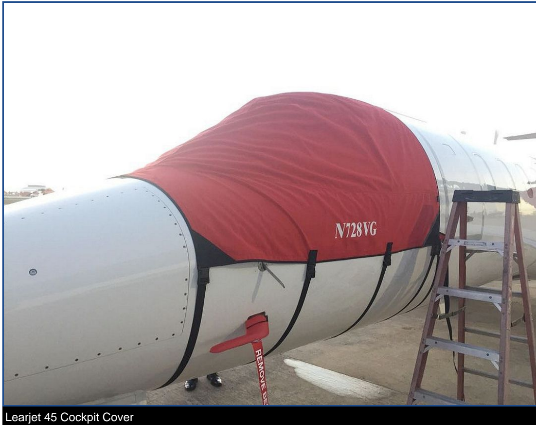
Learjet 45 Cockpit Cover