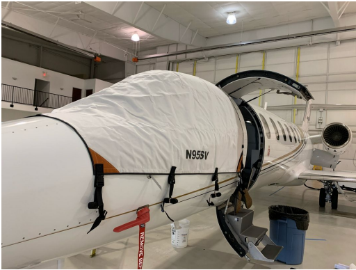
Lear 70 Cockpit Cover

This cover type is made from Silver Acrylic Sunbrella canvas and is 100% lined with a soft and smooth microfiber. Bruce's Custom Covers developed this material combination especially for aircraft protection. The outer material is medium weight and treated for water resistance, UV resistance and anti-static buildup. The inner lining is a very soft and smooth microfiber to prevent scratching. The material is very reflective, and tests show that the cabin interior temperature can be reduced to near-ambient temperature on the hottest of days. It is water, ice and snow repellent, yet breathable to allow moisture to escape from between the cover and the aircraft surface.