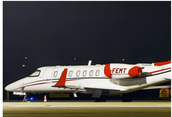
Lear 45 Engine Covers