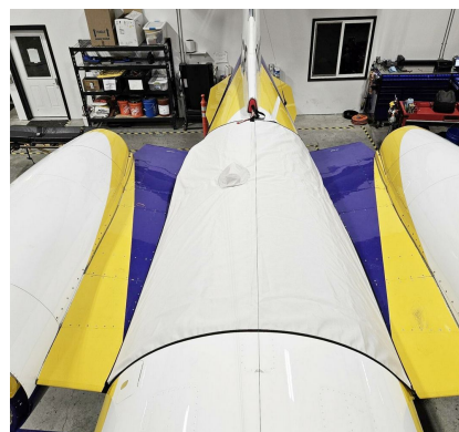
Lear 45 Empennage Saddle Cover W/ Dorsal Inlet Plug (Covers Upper Fuselage Between Pylons, Acm/Apu Area)