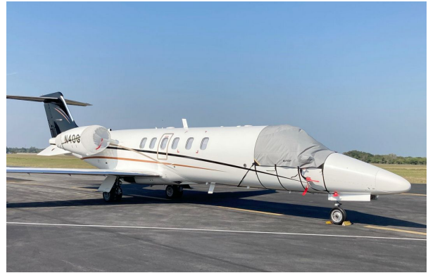
Lear 45 Light Weight Travel Cockpit Cover