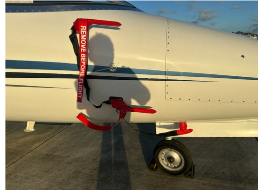
Lear 45 Pitot Cover Set