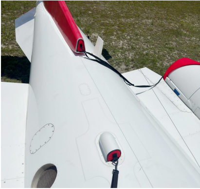
Lear 45 Dorsal, ACM & Fuel Vent Inlet Plugs

The Engine Inlet Plugs are custom fit for your Lear Models 40 & 45 intakes, made with heavy-duty vinyl material, and stuffed with a single block of sculpted urethane foam. Each plug has a zipper that allows the foam to be removed and dried if necessary. Engine plugs have 'remove before flight' streamers sewn onto the face of the plugs. Most plugs are imprinted with the aircraft registration number in black for an extra charge. Storage bag NOT included. Engine plugs may be inserted after flight when the engine is still warm. Engine Inlet Plugs are commonly referred to as Cowl Plugs, Intake Plugs, Cowl Blocks, Engine Blocks, and Engine Bungs.