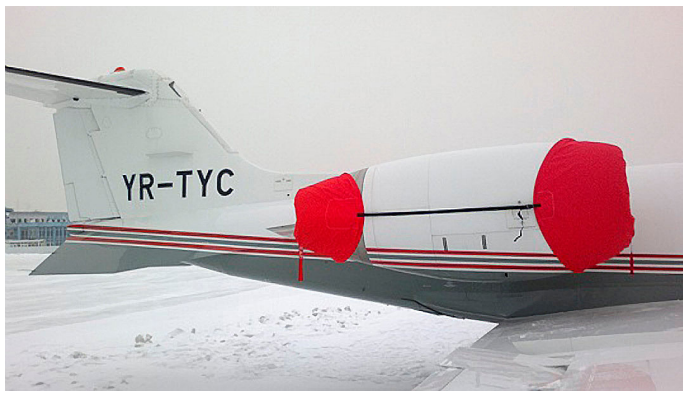
Lear 31 Engine Covers