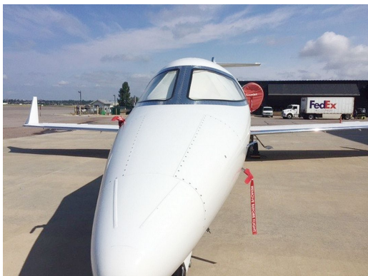
Lear Models 40 & 45 Cockpit Heatshields, Covers All Cockpit Windows

Cockpit Heatshields are interior sunshades for the aircraft's cockpit. The product is a unique composite of closed-cell foam with a silver mylar finish. The semi-rigid design is stiff enough to stand inside the window framing. The set folds up flat and is easily stored in the included storage sleeve. Some designs may require velcro and suction cups. Our Heatshields for jets are offered white side out because some aircraft manufacturers have issued advisories against reflective window inserts due to potential heat damage. A Heatshield is an excellent short-term remedy for cockpit overheating, but an external fabric cover is more effective for long-term protection.