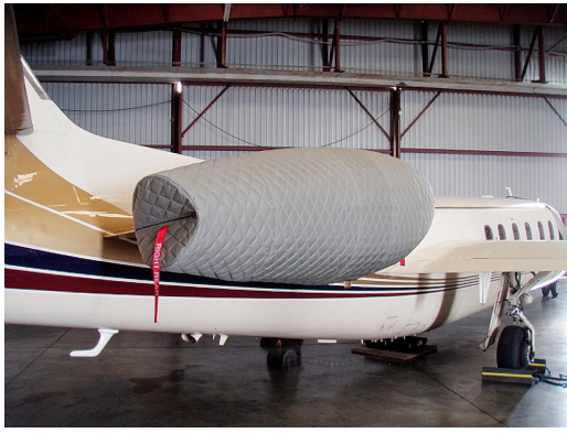
IAI Westwind 1124 Insulated Engine Nacelle Cover