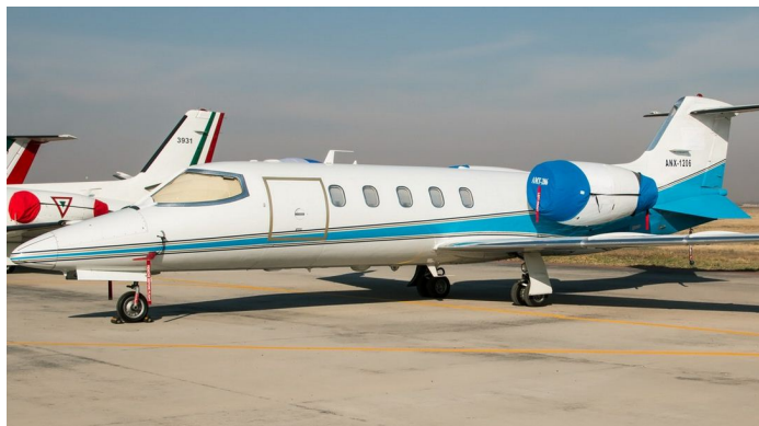
Lear 35 Engine & Pitot Covers

Cockpit Heatshields are interior sunshades for the aircraft's cockpit. The product is a unique composite of closed-cell foam with a silver mylar finish. The semi-rigid design is stiff enough to stand inside the window framing. The set folds up flat and is easily stored in the included storage sleeve. Some designs may require velcro and suction cups. Our Heatshields for jets are offered white side out because some aircraft manufacturers have issued advisories against reflective window inserts due to potential heat damage. A Heatshield is an excellent short-term remedy for cockpit overheating, but an external fabric cover is more effective for long-term protection.