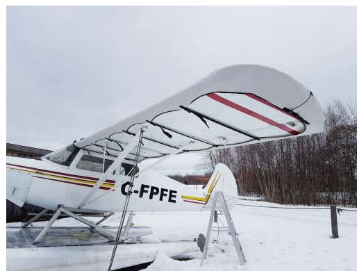
Christavia Mk 1 Wing Covers