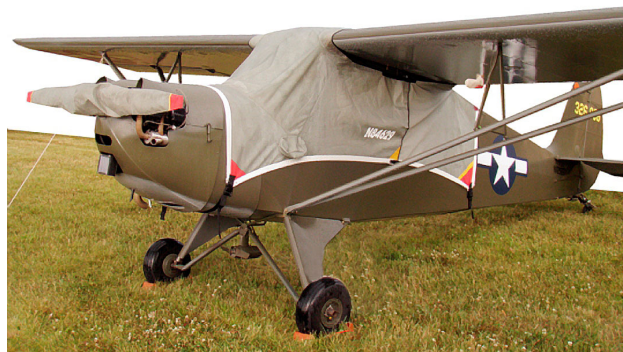
L3 Canopy Cover & Prop Cover

This cover type is made from Silver Acrylic Sunbrella canvas and is 100% lined with a soft and smooth microfiber. Bruce's Custom Covers developed this material combination especially for aircraft protection. The outer material is medium weight and treated for water resistance, UV resistance and anti-static buildup. The inner lining is a very soft and smooth microfiber to prevent scratching. The material is very reflective, and tests show that the cabin interior temperature can be reduced to near-ambient temperature on the hottest of days. It is water, ice and snow repellent, yet breathable to allow moisture to escape from between the cover and the aircraft surface.