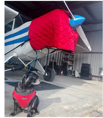
Piper PA-12 Insulated Hangar Blanket