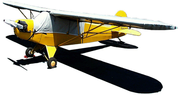
Piper J3 Canopy, Wing and Prop Covers