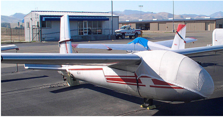
Blanik L13 Canopy/Nose Cover

the hottest of days. It is water, ice and snow repellent, yet breathable to allow moisture to escape from between the cover and the aircraft surface.