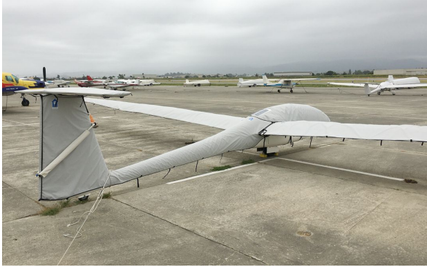
DG-505 Canopy/Nose, Wing, Empennage & Horiz. Stab. Covers

WINTER USE MATERIAL - Made with Solution-Dyed Polyester fabric, this option is intended for seasonal use to aid in deicing, rain mitigation, or for occasional travel. The material is lighter and more compact, but more susceptible to UV damage and may have a shorter useful life if used continuously outside than the all-year use material.