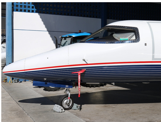
Lear Pitot Cover

The Engine Inlet Plugs are custom fit for your Lear 24 & 25 intakes, made with heavy-duty vinyl material, and stuffed with a single block of sculpted urethane foam. Each plug has a zipper that allows the foam to be removed and dried if necessary. Engine plugs have 'remove before flight' streamers sewn onto the face of the plugs. Most plugs are imprinted with the aircraft registration number in black for an extra charge. Storage bag NOT included. Engine plugs may be inserted after flight when the engine is still warm. Engine Inlet Plugs are commonly referred to as Cowl Plugs, Intake Plugs, Cowl Blocks, Engine Blocks, and Engine Bungs.