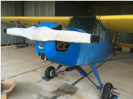
Taylorcraft L-2 Grasshopper Propellor/Spinner Cover

This cover type is made from Silver Acrylic Sunbrella canvas and is 100% lined with a soft and smooth microfiber. Bruce's Custom Covers developed this material combination especially for aircraft protection. The outer material is medium weight and treated for water resistance, UV resistance and anti-static buildup. The inner lining is a very soft and smooth microfiber to prevent scratching. The material is very reflective, and tests show that the cabin interior temperature can be reduced to near-ambient temperature on the hottest of days. It is water, ice and snow repellent, yet breathable to allow moisture to escape from between the cover and the aircraft surface.