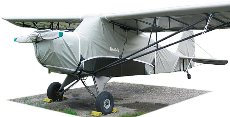
Prop Cover, Engine Cover, Canopy Cover, Wing Covers and Empennage Cover