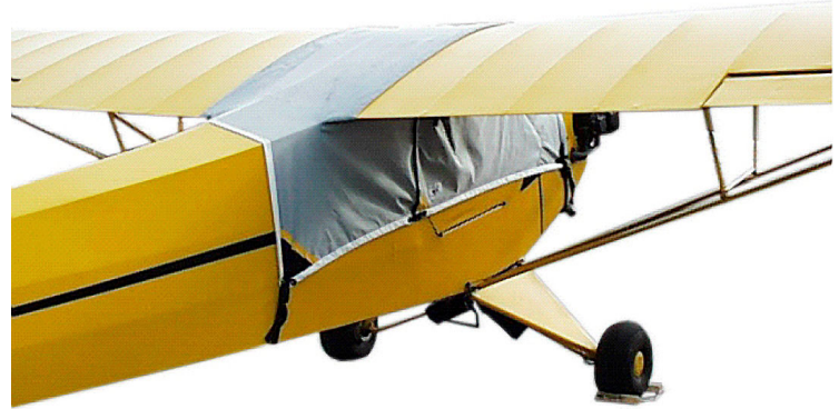
Piper J3 Over-Top Canopy Cover