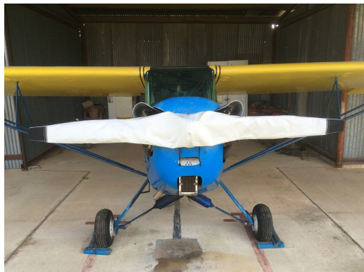
Taylorcraft L-2 Grasshopper Propellor/Spinner Cover

This cover type is made from Silver Acrylic Sunbrella canvas and is 100% lined with a soft and smooth microfiber. Bruce's Custom Covers developed this material combination especially for aircraft protection. The outer material is medium weight and treated for water resistance, UV resistance and anti-static buildup. The inner lining is a very soft and smooth microfiber to prevent scratching. The material is very reflective, and tests show that the cabin interior temperature can be reduced to near-ambient temperature on the hottest of days. It is water, ice and snow repellent, yet breathable to allow moisture to escape from between the cover and the aircraft surface.