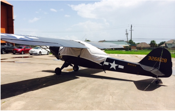
Taylorcraft L-2 Canopy Cover

This cover type is made from Silver Acrylic Sunbrella canvas and is 100% lined with a soft and smooth microfiber. Bruce's Custom Covers developed this material combination especially for aircraft protection. The outer material is medium weight and treated for water resistance, UV resistance and anti-static buildup. The inner lining is a very soft and smooth microfiber to prevent scratching. The material is very reflective, and tests show that the cabin interior temperature can be reduced to near-ambient temperature on the hottest of days. It is water, ice and snow repellent, yet breathable to allow moisture to escape from between the cover and the aircraft surface.