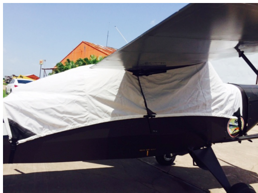
Taylorcraft L-2 Canopy Cover

This cover type is made from Silver Acrylic Sunbrella canvas and is 100% lined with a soft and smooth microfiber. Bruce's Custom Covers developed this material combination especially for aircraft protection. The outer material is medium weight and treated for water resistance, UV resistance and anti-static buildup. The inner lining is a very soft and smooth microfiber to prevent scratching. The material is very reflective, and tests show that the cabin interior temperature can be reduced to near-ambient temperature on the hottest of days. It is water, ice and snow repellent, yet breathable to allow moisture to escape from between the cover and the aircraft surface.