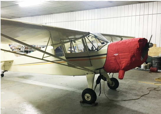
Taylorcraft DC-65 Insulated Engine Cover