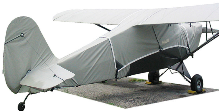
Taylorcraft L-2 Grasshopper Prop, Engine, Canopy, Wing and Empennage Covers

WINTER USE MATERIAL - Made with Solution-Dyed Polyester fabric, this option is intended for seasonal use to aid in deicing, rain mitigation, or for occasional travel. The material is lighter and more compact, but more susceptible to UV damage and may have a shorter useful life if used continuously outside than the all-year use material.