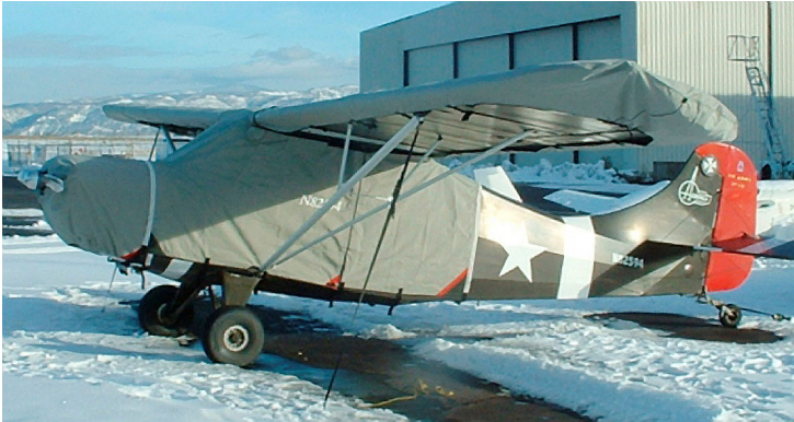
Extended Canopy Cover, Engine & Wing Covers

This cover type is made from Silver Acrylic Sunbrella canvas and is 100% lined with a soft and smooth microfiber. Bruce's Custom Covers developed this material combination especially for aircraft protection. The outer material is medium weight and treated for water resistance, UV resistance and anti-static buildup. The inner lining is a very soft and smooth microfiber to prevent scratching. The material is very reflective, and tests show that the cabin interior temperature can be reduced to near-ambient temperature on the hottest of days. It is water, ice and snow repellent, yet breathable to allow moisture to escape from between the cover and the aircraft surface.