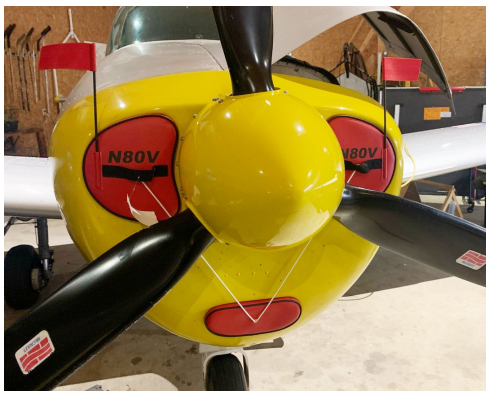
Navion L17 Engine Inlet Plugs