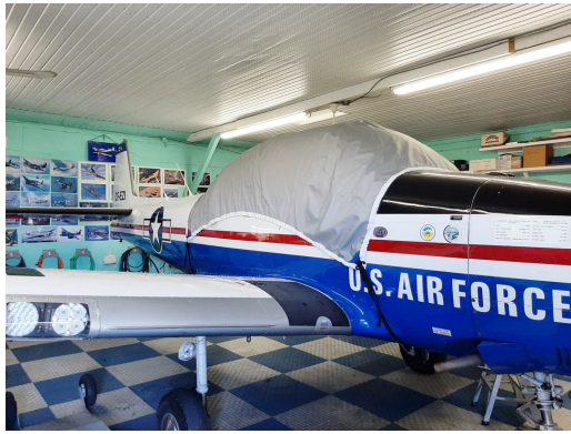
Navion L-17 Travel Cover, Light Weight Canopy Cover (w/out avionics bay extension)