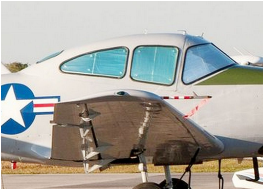
Navion L-17 Heatshield Set

Windshield Heatshields are interior sunshades for an aircraft's front windshield. The product is a unique composite of closed-cell foam with a silver mylar finish. The semi-rigid design is stiff enough to stand along the inside of the windshield using sun visors or window framing. It folds up flat and easily stores in the included storage sleeve. Some designs may require velcro and suction cups or split right and left sides. A Heatshield is an excellent short-term remedy for cockpit overheating. An external fabric cover is far more effective and practical for long-term protection.