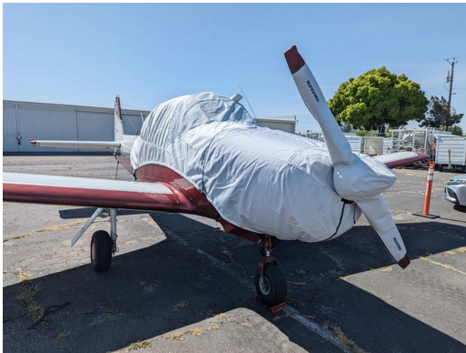
Navion Canopy/Engine Cover, Prop Cover

This cover type is made from Silver Acrylic Sunbrella canvas and is 100% lined with a soft and smooth microfiber. Bruce's Custom Covers developed this material combination especially for aircraft protection. The outer material is medium weight and treated for water resistance, UV resistance and anti-static buildup. The inner lining is a very soft and smooth microfiber to prevent scratching. The material is very reflective, and tests show that the cabin interior temperature can be reduced to near-ambient temperature on the hottest of days. It is water, ice and snow repellent, yet breathable to allow moisture to escape from between the cover and the aircraft surface.