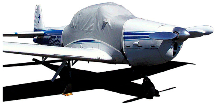
Navion Canopy Cover extends forward to firewall line.