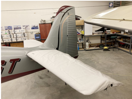
Navion Rangemaster Horizontal Stabilizer Covers

WINTER USE MATERIAL - Made with Solution-Dyed Polyester fabric, this option is intended for seasonal use to aid in deicing, rain mitigation, or for occasional travel. The material is lighter and more compact, but more susceptible to UV damage and may have a shorter useful life if used continuously outside than the all-year use material.