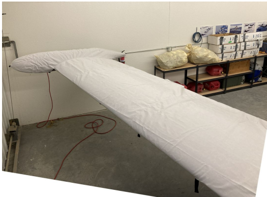
Navion Rangemaster Wing Covers