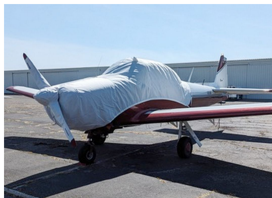
Navion Canopy/Engine Cover, Prop Cover