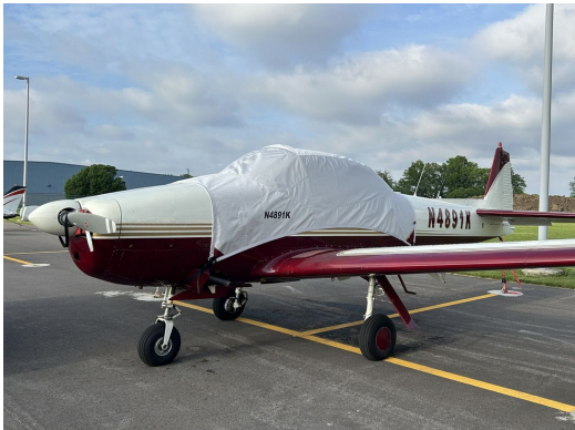
Navion Canopy Cover