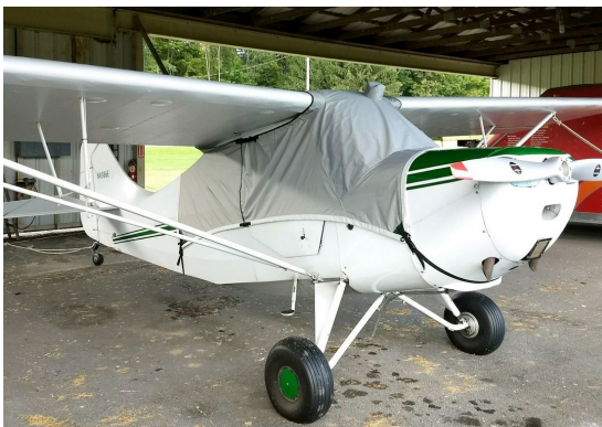
Aeronca Champ Light Weight Travel Canopy Cover, Over-Top Style

This cover type is made from Silver Acrylic Sunbrella canvas and is 100% lined with a soft and smooth microfiber. Bruce's Custom Covers developed this material combination especially for aircraft protection. The outer material is medium weight and treated for water resistance, UV resistance and anti-static buildup. The inner lining is a very soft and smooth microfiber to prevent scratching. The material is very reflective, and tests show that the cabin interior temperature can be reduced to near-ambient temperature on the hottest of days. It is water, ice and snow repellent, yet breathable to allow moisture to escape from between the cover and the aircraft surface.