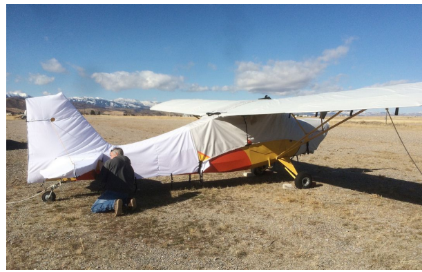
Aeronca Champ Canopy, Wings, Engine & Empennage (test fit) Covers