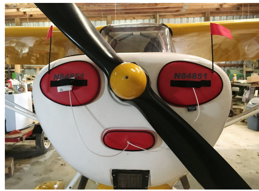
Aeronca 7AC Engine Inlet Plugs