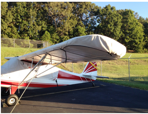
Aeronca Champ Wing Covers, Canopy Cover