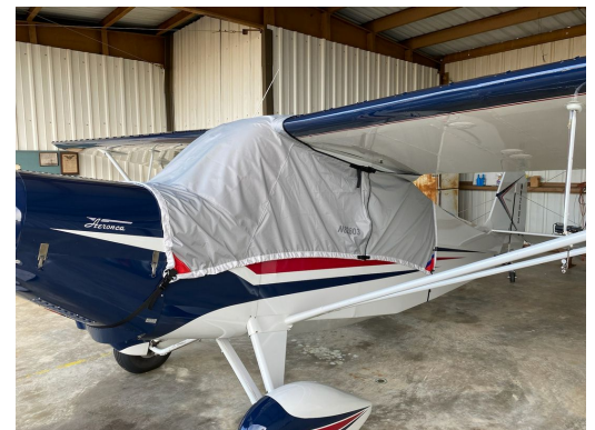
Aeronca Champ Travel Weight Canopy Cover