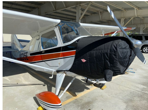
Aeronca Champ 7AC Insulated Engine Cover