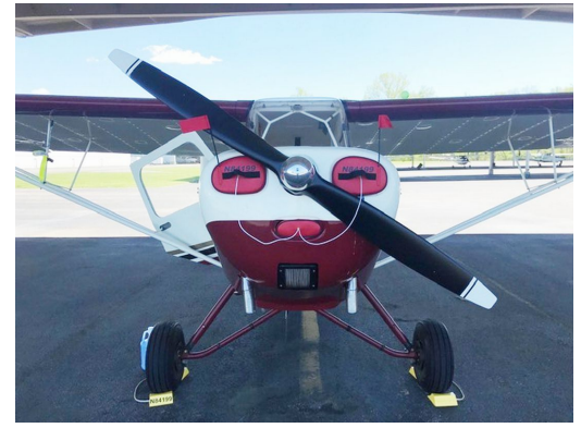
Aeronca Champ 7AC, 7EC Engine Inlet Plugs