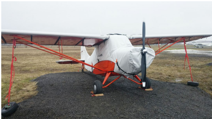
Aeronca Champ 7EC Canopy, Engine, Wing & Empennage Covers

This cover type is made from Silver Acrylic Sunbrella canvas and is 100% lined with a soft and smooth microfiber. Bruce's Custom Covers developed this material combination especially for aircraft protection. The outer material is medium weight and treated for water resistance, UV resistance and anti-static buildup. The inner lining is a very soft and smooth microfiber to prevent scratching. The material is very reflective, and tests show that the cabin interior temperature can be reduced to near-ambient temperature on the hottest of days. It is water, ice and snow repellent, yet breathable to allow moisture to escape from between the cover and the aircraft surface.