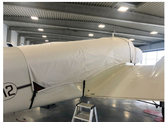
Lockheed 12 Canopy/Nose Cover