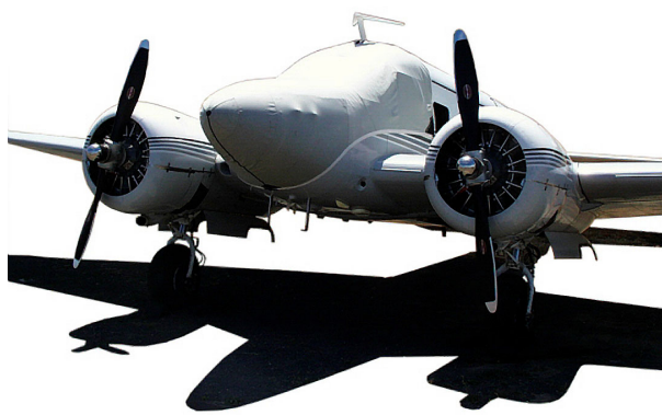
Beech 18 Cockpit/Nose Cover

This cover type is made from Silver Acrylic Sunbrella canvas and is 100% lined with a soft and smooth microfiber. Bruce's Custom Covers developed this material combination especially for aircraft protection. The outer material is medium weight and treated for water resistance, UV resistance and anti-static buildup. The inner lining is a very soft and smooth microfiber to prevent scratching. The material is very reflective, and tests show that the cabin interior temperature can be reduced to near-ambient temperature on the hottest of days. It is water, ice and snow repellent, yet breathable to allow moisture to escape from between the cover and the aircraft surface.