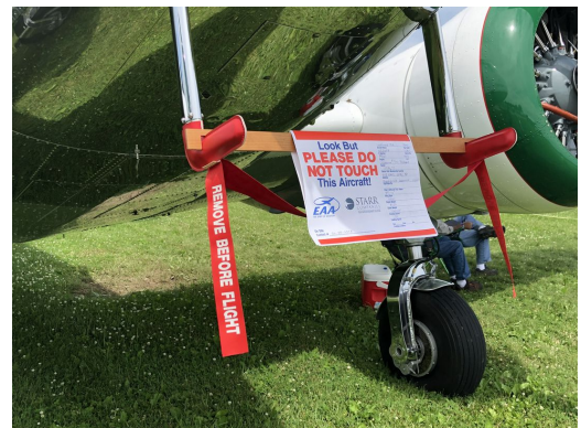
Lockheed 12 Pitot Covers