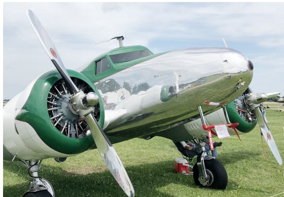
Lockheed 12 Pitot Covers

Lockheed 12 Electra Pitot Tube Covers , NOT HEAT RESISTANT TYPE, are made of Naugahyde vinyl, and are designed to cover the entire pitot assembly. Slipping over the tube, the cover tightens around the base with a Velcro strap detail. A "Remove Before Flight" streamer is attached to the cover. Heat Resistant Pitot Covers are an upgrade to this design, and help prevent the pitot cover from melting onto the tube if the pitot heat is accidentally turned on while installed. If you want the set tethered together, please let us know.