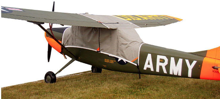
L-19 Canopy Cover