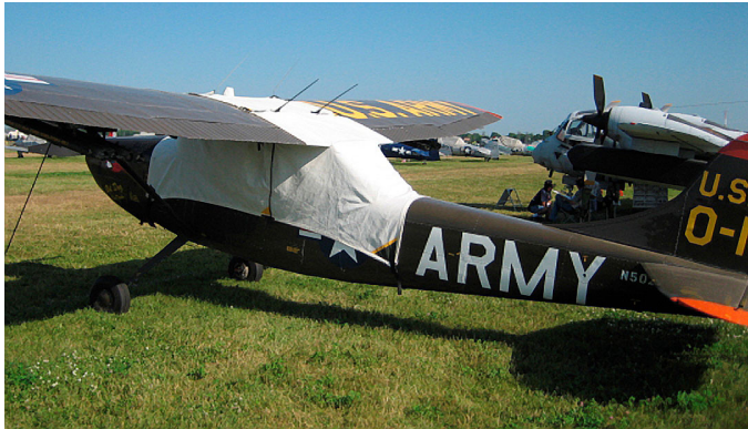
L-19 Canopy Cover

water resistance, UV resistance and anti-static buildup. The inner lining is a very soft and smooth microfiber to prevent scratching. The material is very reflective, and tests show that the cabin interior temperature can be reduced to near-ambient temperature on the hottest of days. It is water, ice and snow repellent, yet breathable to allow moisture to escape from between the cover and the aircraft surface.