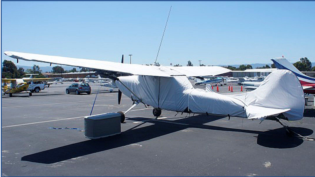
Cessna L-19 Extended Over-the-top Canopy, Engine, Empennage &amp; Wing Covers