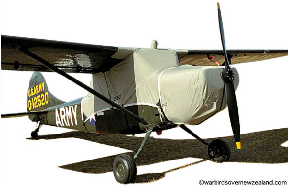
Cessna L-19 Canopy & Engine Covers

water resistance, UV resistance and anti-static buildup. The inner lining is a very soft and smooth microfiber to prevent scratching. The material is very reflective, and tests show that the cabin interior temperature can be reduced to near-ambient temperature on the hottest of days. It is water, ice and snow repellent, yet breathable to allow moisture to escape from between the cover and the aircraft surface.