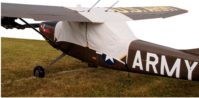
L-19 Canopy Cover

water resistance, UV resistance and anti-static buildup. The inner lining is a very soft and smooth microfiber to prevent scratching. The material is very reflective, and tests show that the cabin interior temperature can be reduced to near-ambient temperature on the hottest of days. It is water, ice and snow repellent, yet breathable to allow moisture to escape from between the cover and the aircraft surface.