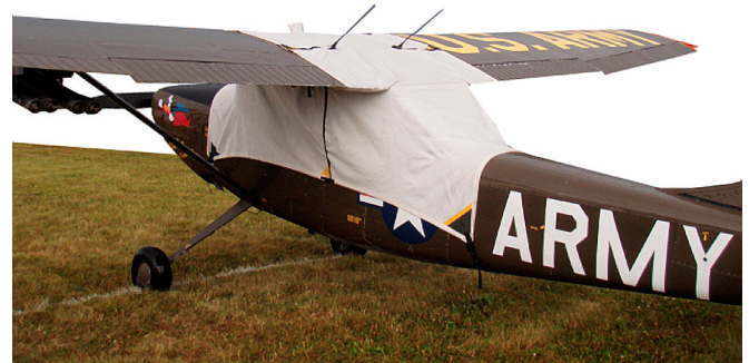
L-19 Canopy Cover