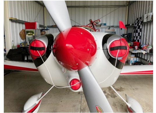
Van's RV-8 Engine Inlet Plugs, Sam James Cowl