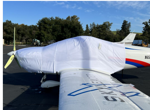
Jihlavan JA-600 Skyleader Extended Canopy/Engine Cover, test fit cover