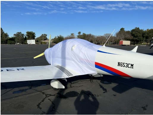
Jihlavan JA-600 Skyleader Extended Canopy/Engine Cover, test fit cover