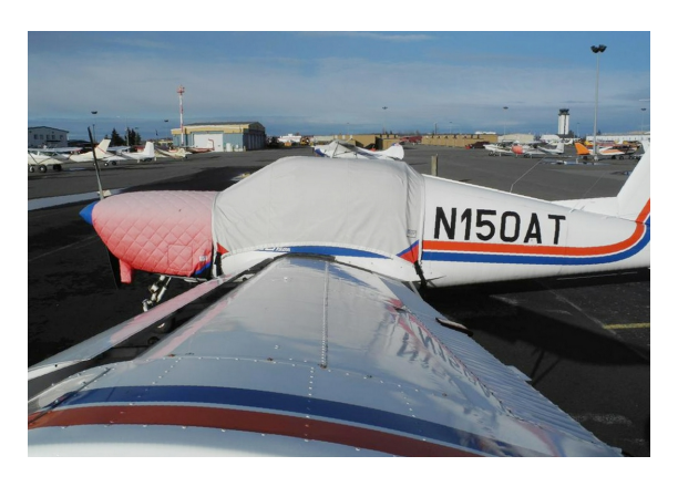
Koliber 150A Canopy Cover, Insulated Engine Cover