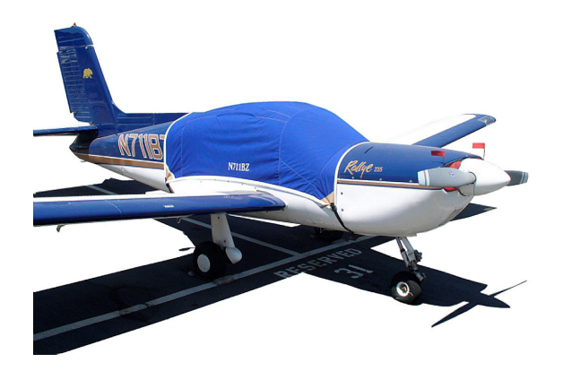
Rallye Canopy Cover