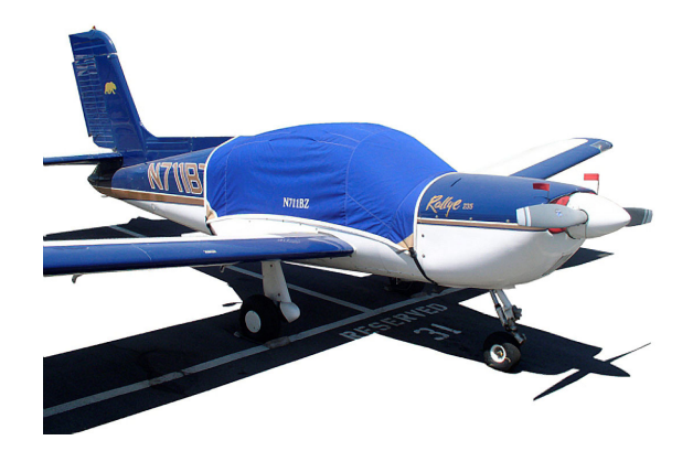
Rallye Canopy Cover