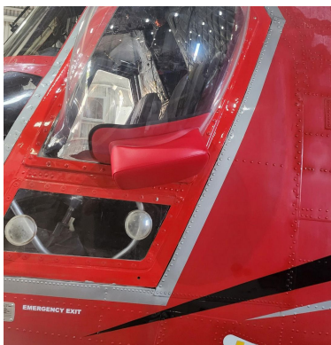
Boeing Vertol CH-47 Logger Window Plug

The Engine Inlet Plugs are custom fit for your Kaman KMAX intakes, made with heavy-duty vinyl material, and stuffed with a single block of sculpted urethane foam. Each plug has a zipper that allows the foam to be removed and dried if necessary. Engine plugs have 'Remove Before Flight' streamers sewn onto the face of the plugs. Most plugs are imprinted with the aircraft registration number in black for an extra charge. Storage bag NOT included. Engine plugs may be inserted after flight when the engine is still warm. Engine Inlet Plugs are commonly referred to as Cowl Plugs, Intake Plugs, Cowl Blocks, Engine Blocks, and Engine Bungs.