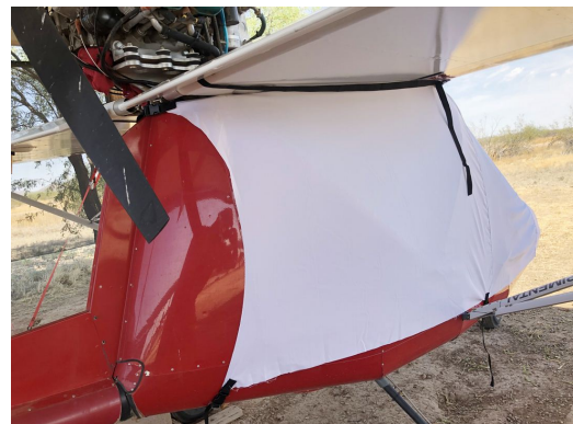
Rans S-12 Airaille Canopy/Nose Cover (test fit cover)