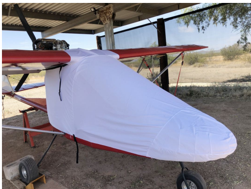
Rans S-12 Airaille Canopy/Nose Cover (test fit cover)

Travel Covers are made with Silver Solution-Dyed Polyester fabric and only lined over the windshield to save weight. The material is lightweight and more compact for easy stowage in the aircraft. The polyester material is water resistant, but only intended for occasional use outside. We also have an ultra lightweight material available for fitted hangar dust covers. For daily outdoor use, the non-travel Sunbrella Cover is the best choice.