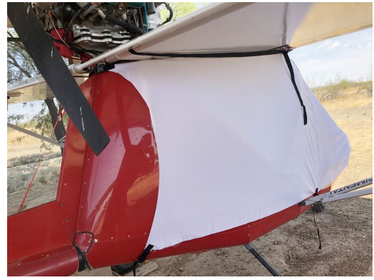
Rans S-12 Airaile Canopy/Nose Cover (test fit cover)