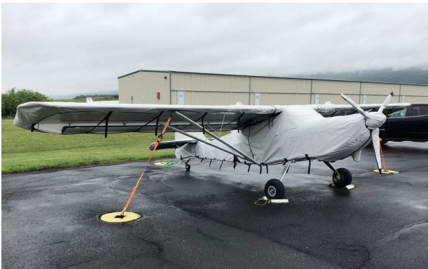
Kitfox 5 Complete Cover Set