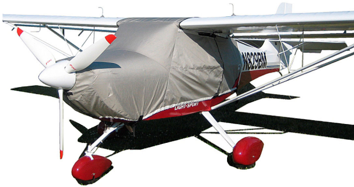
Aerotrek A240 Canopy/Engine Cover

This cover type is made from Silver Acrylic Sunbrella canvas and is 100% lined with a soft and smooth microfiber. Bruce's Custom Covers developed this material combination especially for aircraft protection. The outer material is medium weight and treated for water resistance, UV resistance and anti-static buildup. The inner lining is a very soft and smooth microfiber to prevent scratching. The material is very reflective, and tests show that the cabin interior temperature can be reduced to near-ambient temperature on the hottest of days. It is water, ice and snow repellent, yet breathable to allow moisture to escape from between the cover and the aircraft surface.