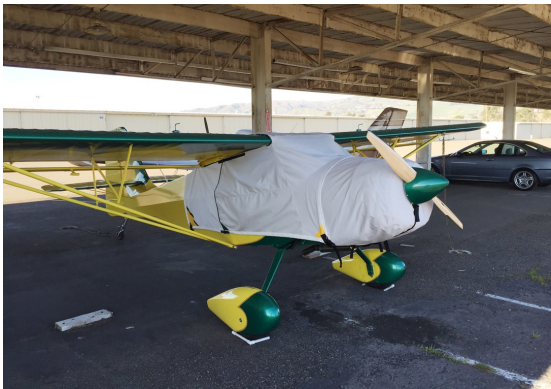
Kitfox Canopy & Engine Covers

This cover type is made from Silver Acrylic Sunbrella canvas and is 100% lined with a soft and smooth microfiber. Bruce's Custom Covers developed this material combination especially for aircraft protection. The outer material is medium weight and treated for water resistance, UV resistance and anti-static buildup. The inner lining is a very soft and smooth microfiber to prevent scratching. The material is very reflective, and tests show that the cabin interior temperature can be reduced to near-ambient temperature on the hottest of days. It is water, ice and snow repellent, yet breathable to allow moisture to escape from between the cover and the aircraft surface.