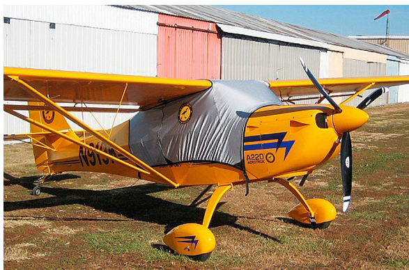
Aerotrek A220 Fitted Hangar Dust Cover

Travel Covers are made with Silver Solution-Dyed Polyester fabric and only lined over the windshield to save weight. The material is lightweight and more compact for easy stowage in the aircraft. The polyester material is water resistant, but only intended for occasional use outside. We also have an ultra lightweight material available for fitted hangar dust covers. For daily outdoor use, the non-travel Sunbrella Cover is the best choice.