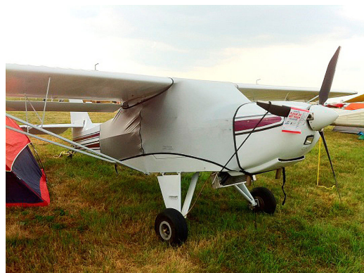
Kitfox Spandex FlyAway Travel Canopy Cover