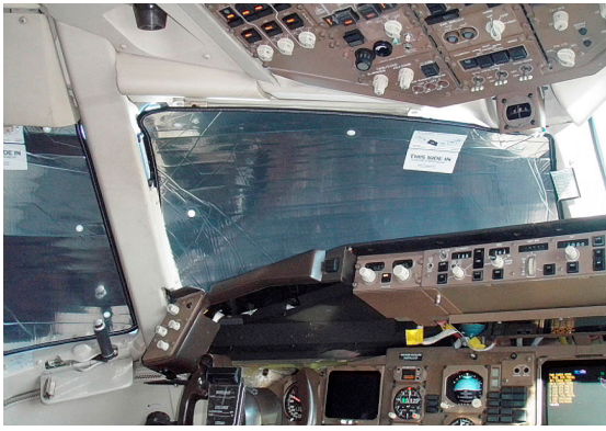
Boeing 767 Cockpit HeatShield set