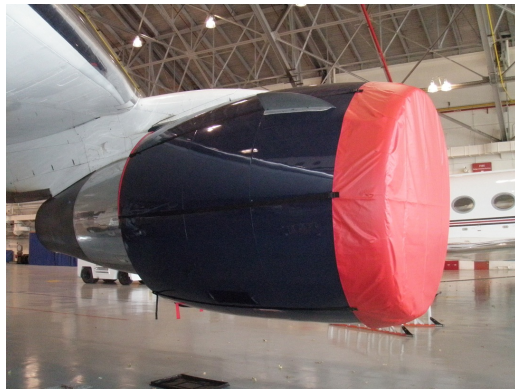
Boeing 767 Intake Covers Ship Set