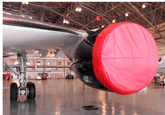
Boeing 767 Intake Covers Ship Set