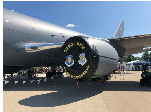
Boeing KC-46 Intake Cover