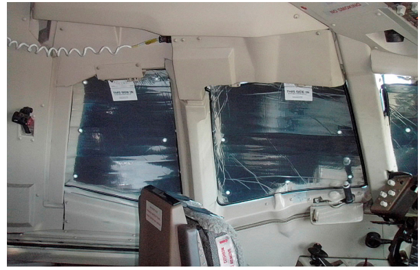
Boeing 767 Cockpit HeatShield set