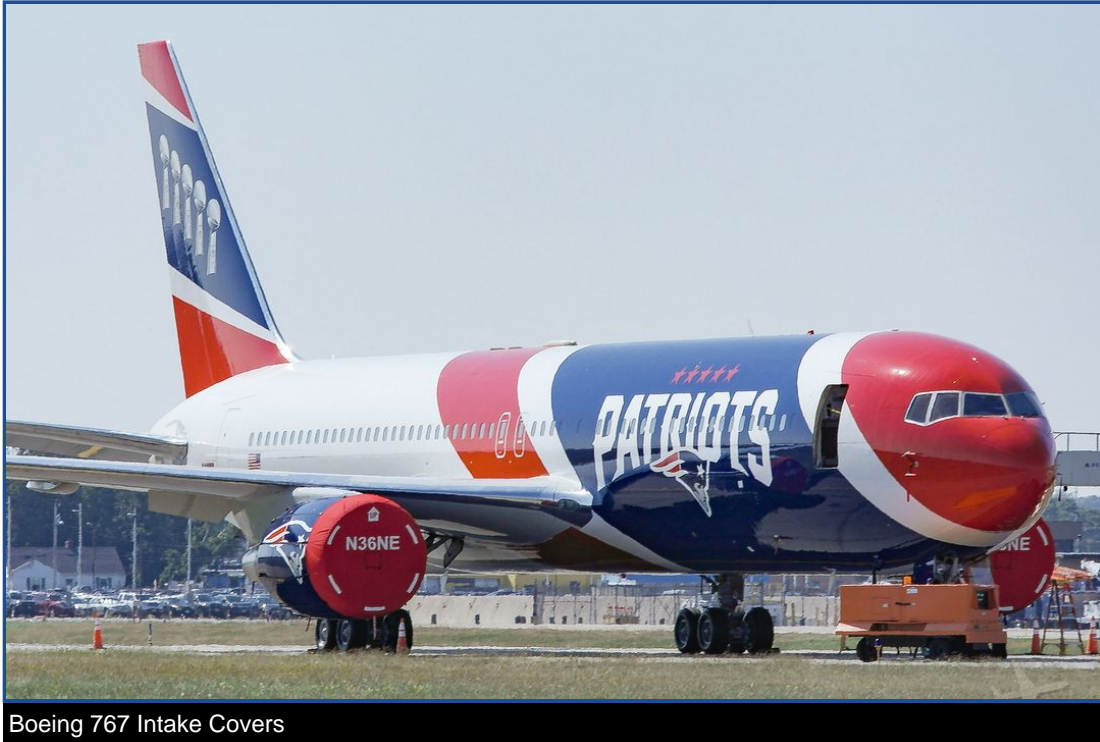
Boeing 767 Intake Covers