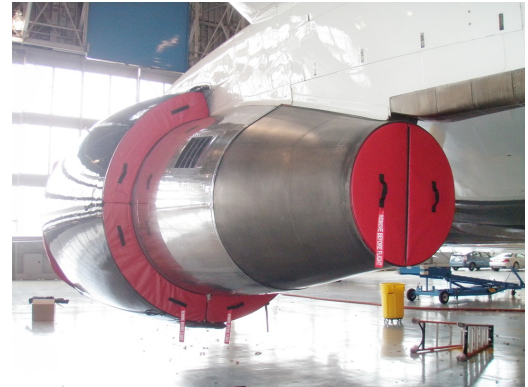
Exhaust Plugs Ship Set, incl. Fan Thrust Reverser and Exhaust Plugs P/N: B767-200