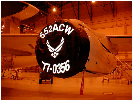
Intake/Exhaust Covers, soft type, TF-33 Engines

The Engine Inlet Plugs are custom fit for your Boeing KC-135, C-135, RC-135, EC-135 intakes, made with heavy-duty vinyl material, and stuffed with a single block of sculpted urethane foam. Each plug has a zipper that allows the foam to be removed and dried if necessary. Engine plugs have 'remove before flight' streamers sewn onto the face of the plugs. Most plugs are imprinted with the aircraft registration number in black for an extra charge. Storage bag NOT included. Engine plugs may be inserted after flight when the engine is still warm. Engine Inlet Plugs are commonly referred to as Cowl Plugs, Intake Plugs, Cowl Blocks, Engine Blocks, and Engine Bung.