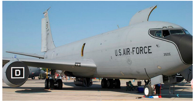
KC-135 "Tambourine" style, Double Fold Intake Covers with artwork