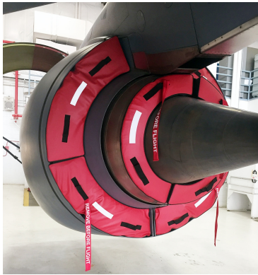
Boeing KC-135 Bypass Vent & Exhaust Plugs

The Engine Inlet Plugs are custom fit for your Boeing KC-135, C-135, RC-135, EC-135 intakes, made with heavy-duty vinyl material, and stuffed with a single block of sculpted urethane foam. Each plug has a zipper that allows the foam to be removed and dried if necessary. Engine plugs have 'remove before flight' streamers sewn onto the face of the plugs. Most plugs are imprinted with the aircraft registration number in black for an extra charge. Storage bag NOT included. Engine plugs may be inserted after flight when the engine is still warm. Engine Inlet Plugs are commonly referred to as Cowl Plugs, Intake Plugs, Cowl Blocks, Engine Blocks, and Engine Bungs.