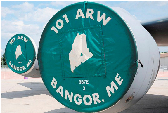
KC-135 "Tamborine" type Intake Covers

The Boeing KC-135, C-135, RC-135, EC-135 Intake Covers are designed to install easily yet be completely storable. A spring steel hoop is sewn into the hem of each cover, allowing them to be installed without climbing onto the wing or using a stepladder. To store the covers the spring steel hoop folds like a band-saw blade into three nesting rings. Each cover folds into a compact circular bundle which is stored in the included duffle bag, yet they unfold quickly for use. The Tri-Fold Ring cover is made of medium weight nylon which is available in a variety of colors to match the paint trim. Each cover set comes complete with installation and folding instructions. The aircraft's registration number can be silkscreened onto the cover for an extra charge.