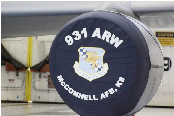
KC135 Intake Covers, Soft Type, R-Model, CFM56 Engines