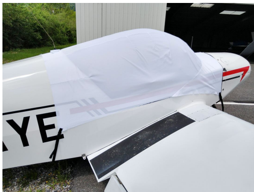
Jodel D113V Canopy Cover, test fit cover

the hottest of days. It is water, ice and snow repellent, yet breathable to allow moisture to escape from between the cover and the aircraft surface.