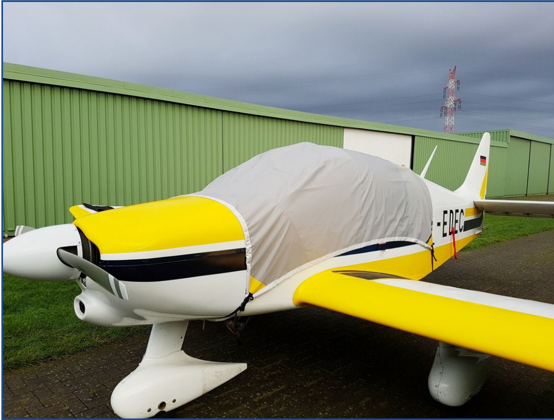
Robin DR400/R Travel Cover, Light Weight Travel Canopy Cover