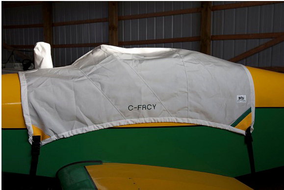
Jodel D9 Bebe Canopy Cover

Travel Covers are made with Silver Solution-Dyed Polyester fabric and only lined over the windshield to save weight. The material is lightweight and more compact for easy stowage in the aircraft. The polyester material is water resistant, but only intended for occasional use outside. We also have an ultra lightweight material available for fitted hangar dust covers. For daily outdoor use, the non-travel Sunbrella Cover is the best choice.