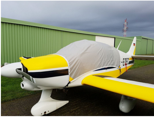
Robin DR400/R Travel Cover, Light Weight Travel Canopy Cover

the hottest of days. It is water, ice and snow repellent, yet breathable to allow moisture to escape from between the cover and the aircraft surface.