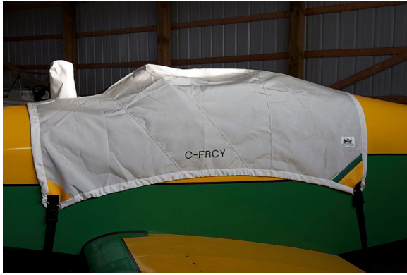
Jodel D9 Bebe Canopy Cover

the hottest of days. It is water, ice and snow repellent, yet breathable to allow moisture to escape from between the cover and the aircraft surface.