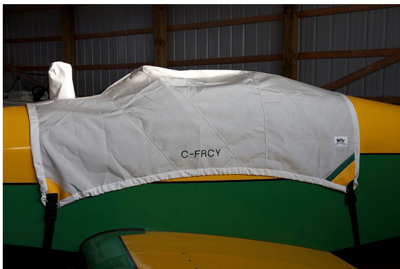
Jodel D9 Bebe Canopy Cover