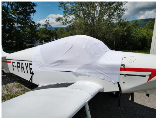
Jodel D113V Canopy Cover, test fit cover

Travel Covers are made with Silver Solution-Dyed Polyester fabric and only lined over the windshield to save weight. The material is lightweight and more compact for easy stowage in the aircraft. The polyester material is water resistant, but only intended for occasional use outside. We also have an ultra lightweight material available for fitted hangar dust covers. For daily outdoor use, the non-travel Sunbrella Cover is the best choice.