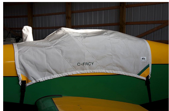
Jodel D9 Bebe Canopy Cover