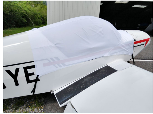
Jodel D113V Canopy Cover, test fit cover