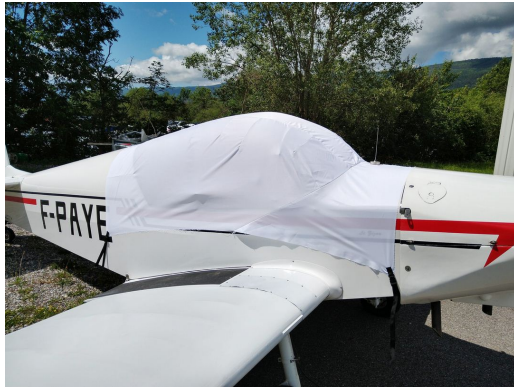
Jodel D113V Canopy Cover, test fit cover

the hottest of days. It is water, ice and snow repellent, yet breathable to allow moisture to escape from between the cover and the aircraft surface.