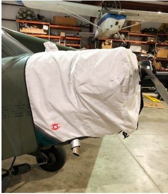
Piper J3C-65 Engine Cover