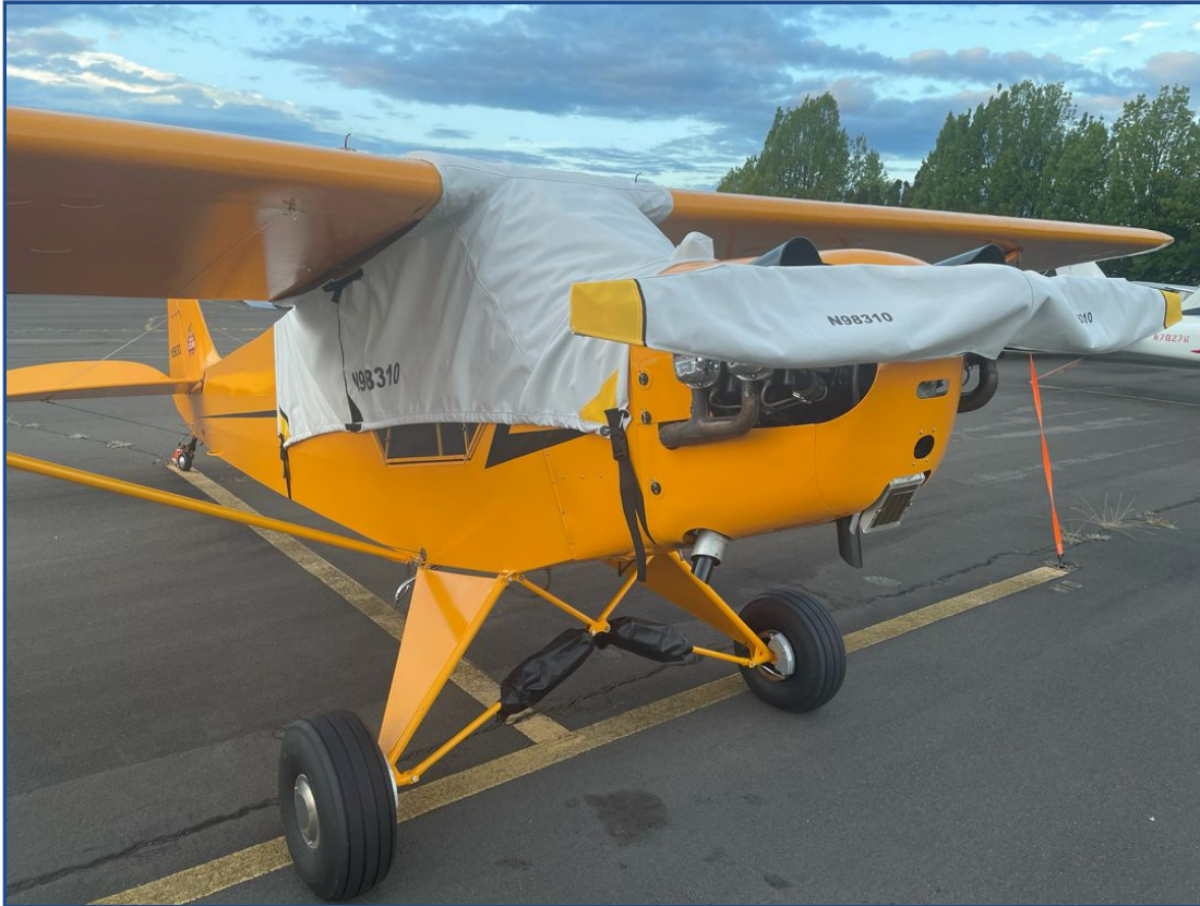
Piper J3 Canopy Cover, Prop Cover