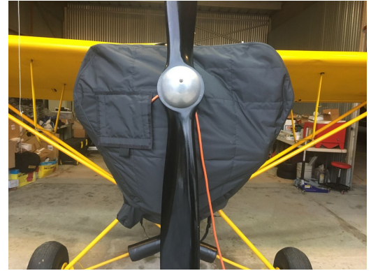
Piper J3 Cub Insulated Engine Cover