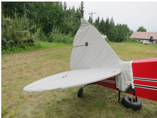
Piper PA-12 Abbreviated Empennage Cover

WINTER USE MATERIAL - Made with Solution-Dyed Polyester fabric, this option is intended for seasonal use to aid in deicing, rain mitigation, or for occasional travel. The material is lighter and more compact, but more susceptible to UV damage and may have a shorter useful life if used continuously outside than the all-year use material.