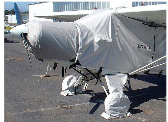
Piper PA-12 Landing Gear Covers