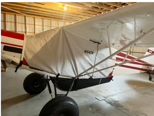
Piper PA-11 Extended Canopy Cover, Over the Top Style

This cover type is made from Silver Acrylic Sunbrella canvas and is 100% lined with a soft and smooth microfiber. Bruce's Custom Covers developed this material combination especially for aircraft protection. The outer material is medium weight and treated for water resistance, UV resistance and anti-static buildup. The inner lining is a very soft and smooth microfiber to prevent scratching. The material is very reflective, and tests show that the cabin interior temperature can be reduced to near-ambient temperature on the hottest of days. It is water, ice and snow repellent, yet breathable to allow moisture to escape from between the cover and the aircraft surface.