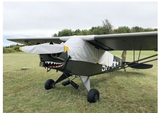
Piper L-4 Over-Top Canopy Cover, Prop Cover