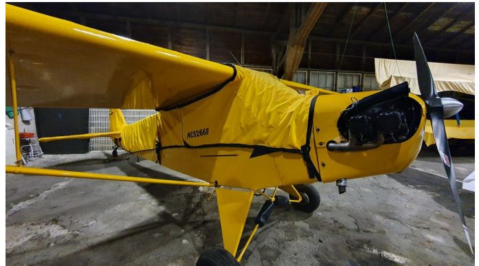
Piper J3 Over The Top Style Canopy Cover & Empennage Cover