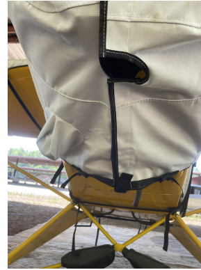
Piper J-3C-65 Cub Engine Cover, Fully Enclosed