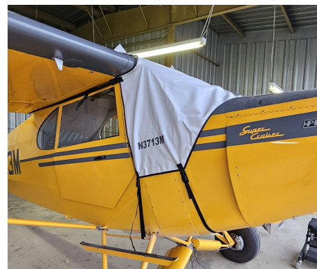
Piper PA-12: Super Cruiser, J5 Cub Windshield/Skylight Cover