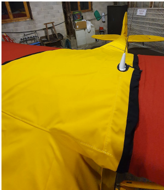
Piper J3 Over The Top Style Canopy Cover & Empennage Cover

WINTER USE MATERIAL - Made with Solution-Dyed Polyester fabric, this option is intended for seasonal use to aid in deicing, rain mitigation, or for occasional travel. The material is lighter and more compact, but more susceptible to UV damage and may have a shorter useful life if used continuously outside than the all-year use material.