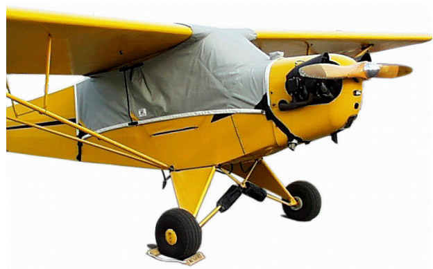
Piper J3 Canopy Cover