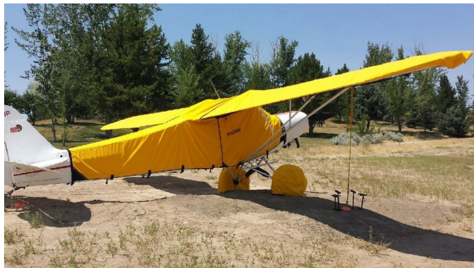
Piper PA-18 Super Cub Extended Canopy Cover, Wing & Tire Covers

ALL-YEAR USE MATERIAL - Made with Silver Acrylic Sunbrella canvas, the all-year use material is the best option for sun protection and cover longevity. This heavier more durable material is intended for all weather conditions, such as rain and snow or lots of sun.