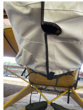
Piper J-3C-65 Cub Engine Cover, Fully Enclosed