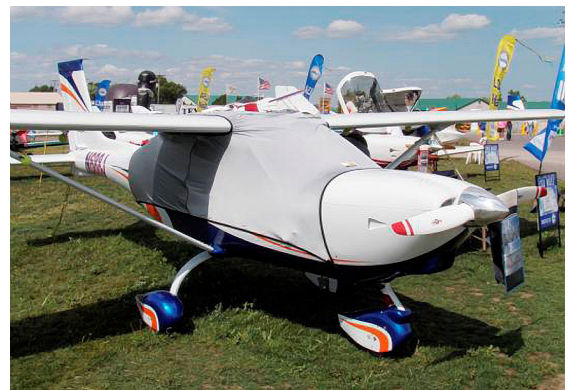
Jabiru Spandex FlyAway Travel Canopy Cover