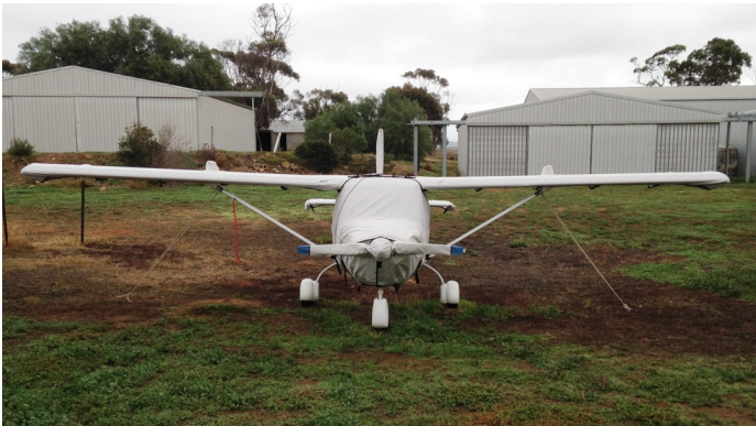
Jabiru 160 Canopy, Engine, Prop, Wings & Empennage Covers

WINTER USE MATERIAL - Made with Solution-Dyed Polyester fabric, this option is intended for seasonal use to aid in deicing, rain mitigation, or for occasional travel. The material is lighter and more compact, but more susceptible to UV damage and may have a shorter useful life if used continuously outside than the all-year use material.