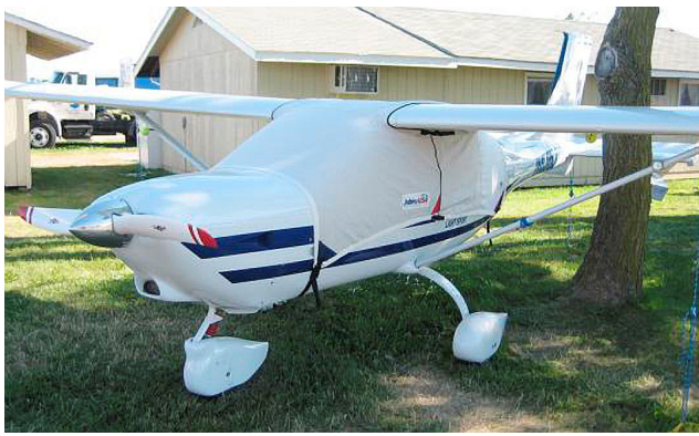
Jabiru 250 Standard Canopy Cover