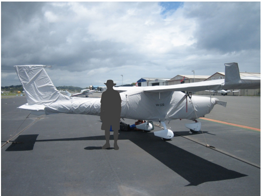
Jabiru J430 Complete Cover Set