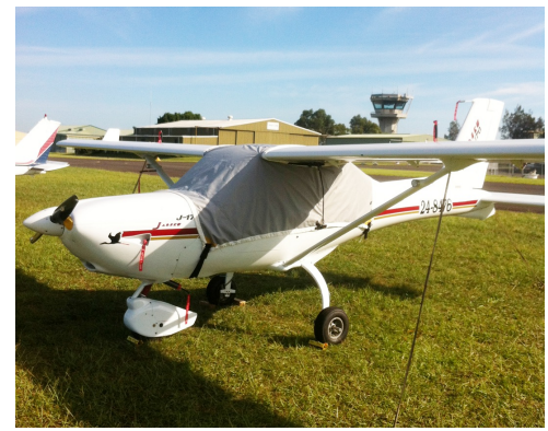
Jabiru 170 Canopy Cover