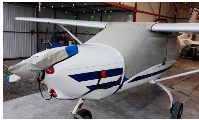
Jabiru J250 Canopy & Prop Cover