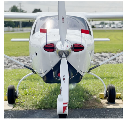
Jabiru J230-SP Engine Inlet Plugs