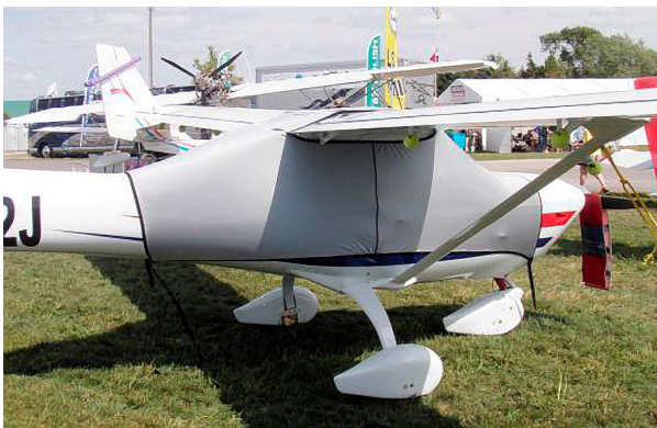
Jabiru Spandex FlyAway Travel Canopy Cover

Travel Covers are made with Silver Solution-Dyed Polyester fabric and only lined over the windshield to save weight. The material is lightweight and more compact for easy stowage in the aircraft. The polyester material is water resistant, but only intended for occasional use outside. We also have an ultra lightweight material available for fitted hangar dust covers. For daily outdoor use, the non-travel Sunbrella Cover is the best choice.