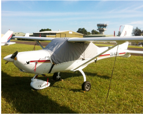
Jabiru 170 Canopy Cover

This cover type is made from Silver Acrylic Sunbrella canvas and is 100% lined with a soft and smooth microfiber. Bruce's Custom Covers developed this material combination especially for aircraft protection. The outer material is medium weight and treated for water resistance, UV resistance and anti-static buildup. The inner lining is a very soft and smooth microfiber to prevent scratching. The material is very reflective, and tests show that the cabin interior temperature can be reduced to near-ambient temperature on the hottest of days. It is water, ice and snow repellent, yet breathable to allow moisture to escape from between the cover and the aircraft surface.