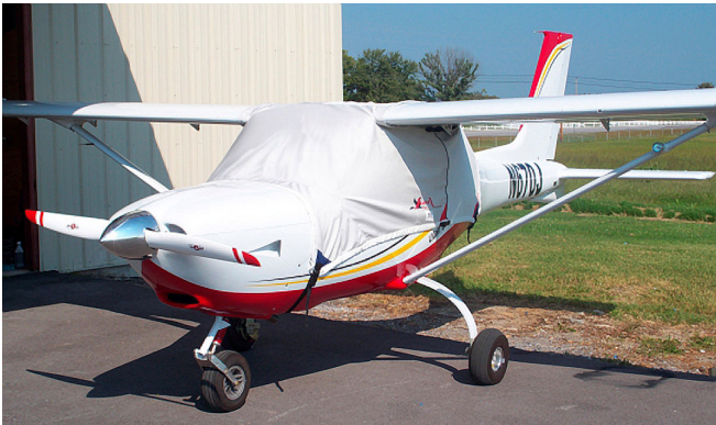
Jabiru 170 Canopy Cover