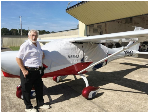
Jabiru 230SP Canopy Cover, Over-Top Style

This cover type is made from Silver Acrylic Sunbrella canvas and is 100% lined with a soft and smooth microfiber. Bruce's Custom Covers developed this material combination especially for aircraft protection. The outer material is medium weight and treated for water resistance, UV resistance and anti-static buildup. The inner lining is a very soft and smooth microfiber to prevent scratching. The material is very reflective, and tests show that the cabin interior temperature can be reduced to near-ambient temperature on the hottest of days. It is water, ice and snow repellent, yet breathable to allow moisture to escape from between the cover and the aircraft surface.