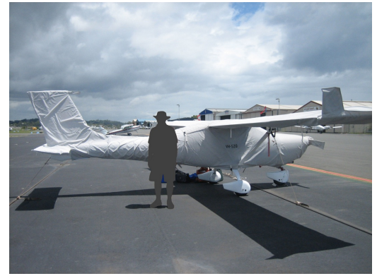
Jabiru J430 Complete Cover Set