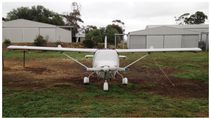
Jabiru 160 Canopy, Engine, Prop, Wings & Empennage Covers Jabiru 160 Canopy, Engine, Prop, Wings & Empennage Covers