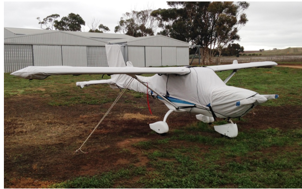
Jabiru 160 Canopy, Engine, Prop, Wings & Empennage Covers