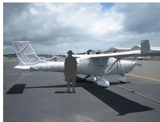
Jabiru J430 Complete Cover Set