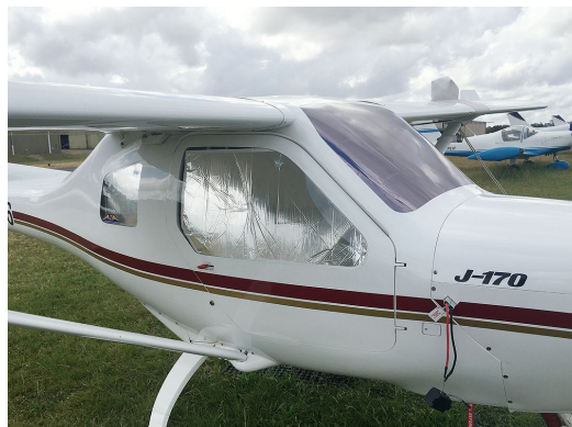
Jabiru 170 Heatshield Set

Heatshields are interior sunshades for an aircraft's windows or canopy glass. The product is a unique composite of closed-cell foam with a silver mylar finish. The semi-rigid design is stiff enough to stand along the inside of the windshield using sun visors or window framing. It folds up flat and easily stores in the included storage sleeve. Some designs may require velcro and suction cups. A Heatshield is an excellent short-term remedy for cockpit overheating.