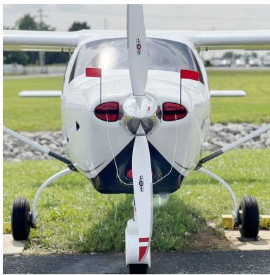
Jabiru J230-SP Engine Inlet Plugs