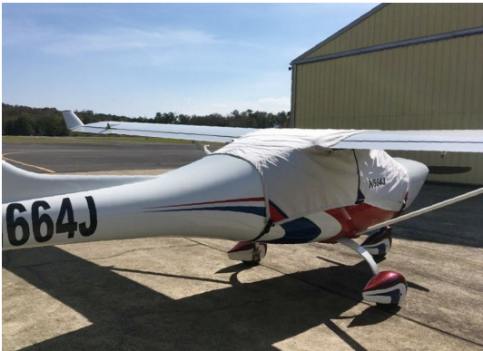
Jabiru J230-SP Canopy Cover, Over-Top Style