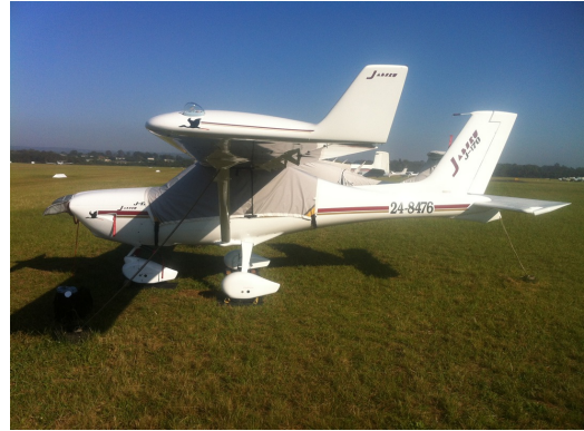
Jabiru 170 Canopy Cover